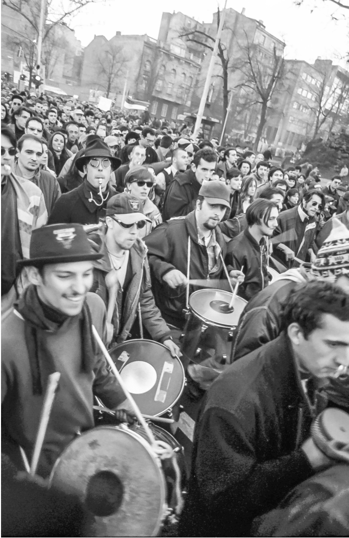
Figure 2: Student protests, 1996, Belgrade.

performance of the Symphony for Whistles, Trumpets, and Drums directed by the composer Zoran Hristić in the closing ceremony of the civil and student protests. 71