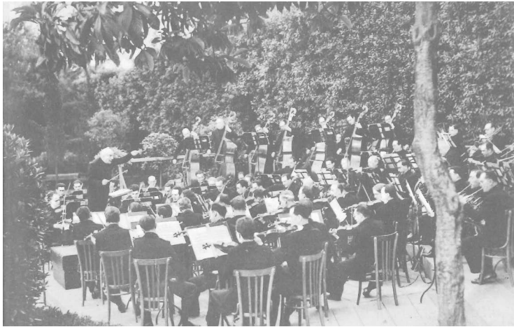
Figure 4: Orchestra of the Accademia di Santa Cecilia under the baton of conductor Bernardino Molinari.

massacre of French troops by Sicilian patriots (which is already announced in the overture by the thematic choice). A few days before Italy's invasion of France, the parallelism was explicit, although not exploited by the press.