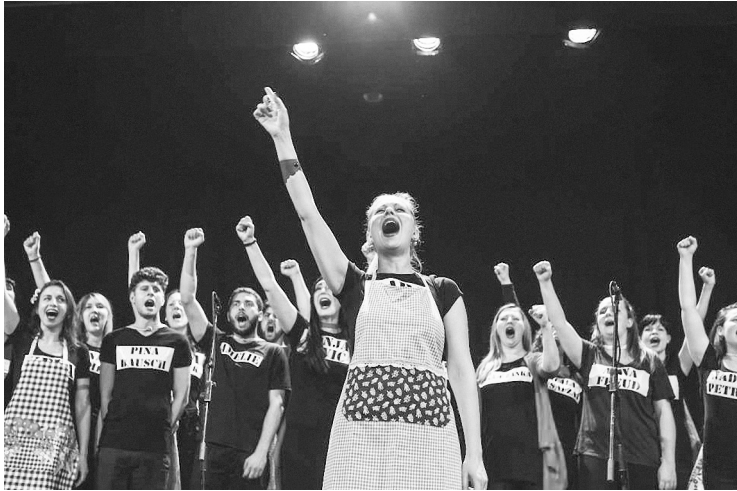
Figure 4: Horkestar on regional tour: Festival of self-organized choirs, 2018, performance, Zagreb.

Similar choirs were also formed throughout the region, including the lesbian-feminist choir Le zbor in Croatia in 2005, Prrrroba made of ex-Horkeškart members in Belgrade in 2007, the female choir Kombinat in Slovenia in 2008, Raspeani Skopjani in Macedonia in 2009, the lesbian-feminist choir Le wHore in 2010, and the anti-fascist choir Naša pjesma (Our Song) in 2016 in Belgrade. These self-organized collectives have been more than choirs; as creative platforms, they have been carrying and spreading socially engaging messages, calling for solidarity and humanity, stressing the importance of musical association and the (out-)loud expression of resistance and social criticism.