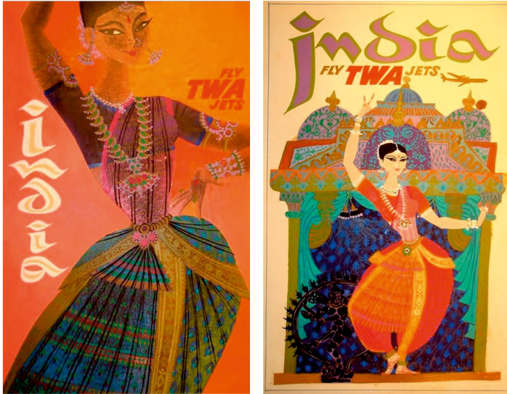
Figures 2 and 3: Trans World Air advertisements (1960s) featuring a female Indian classical dancer as a symbol of Indian tourism. Artist credit: David Klein.

both in India and in all the spaces and places where India is evoked. 13 The Indian classical dancer and her counterpart in film cultures has animated and mobilized identity politics in ways that have become increasingly urgent with the ascendance of the Hindu nationalist Bharatiya Janata Party (BJP), led by Prime Minister Narendra Modi and his rhetoric of “India First.”