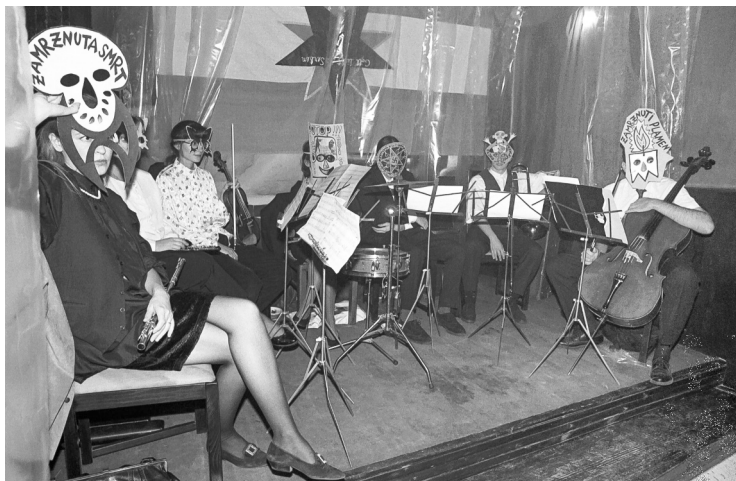
Figure 1: Led Art collective, New Art Forum ensemble for contemporary music, and Mikrob, Potop (Flood), 1993, performance, Novi Sad.

radio audience increased significantly, and people realized that anyone could contribute.