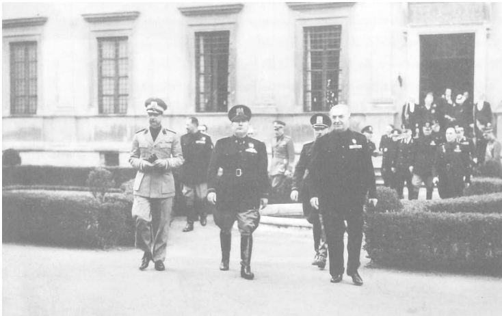
Figure 2: Guests, led by the president of the Academy of Italy Luigi Federzoni (right) alongside Mussolini (center), moving towards the concert in the gardens of the Villa Farnesina.