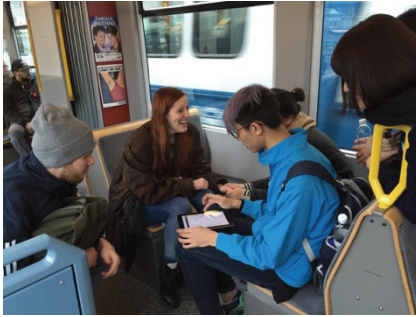
Figure 2/3: LucyZH player race across the city by tram, browsing through the virtual card archive/ LucyZH logo with an intercultural fantasy-animal.