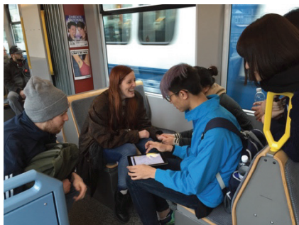
Figure 2/3: LucyZH player race across the city by tram, browsing through the virtual card archive/ LucyZH logo with an intercultural fantasy-animal.