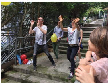
Figure 8/9: Randomness of the wind as game mechanic for Step Up & Play/ Step Up & Play Logo.

The core element of the festival was a game design workshop in the Connecting Space gallery in Hong Kong, where we invited participants to first create, then go out and play games revolving around stairs. We brought along a booklet containing the “Best of Stair Games” that we had created together with the Swiss and Hong Kong Master students, so the workshop participants (who were not game designers per se) could get some inspiration.