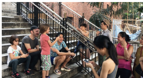
Figure 6/7: Guided game tour for Stair Quest/ Stair Quest logo.

As a second incentive we brought in a collaborative game mechanic and connected it to the level system: even though we kept the leaderboard and the individual ranking, several players would be needed to interact with the same stair in order to complete it. Also, points (or “Dragon Dust”) had to be accumulated by a number of players in order to progress in the game and to level-up together. The game progression – tying together narrative and game mechanic – was visualized by the image of a Dragon which was assembled as a jigsaw puzzle in 8 levels (8 being a happy number in Chinese culture). We implemented a “News” function as another community-centered tool, where we could add specific requests for the players, e.g. have weekly topics for them to write about, or shout-out the leading player, etc.