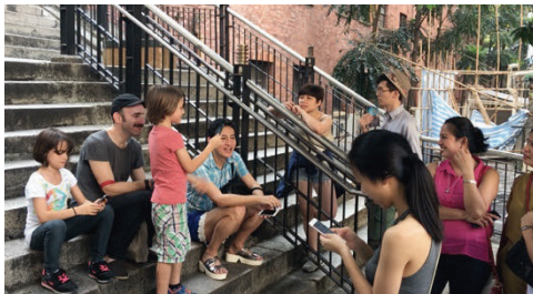
Figure 6/7: Guided game tour for Stair Quest/ Stair Quest logo.

As a second incentive we brought in a collaborative game mechanic and connected it to the level system: even though we kept the leaderboard and the individual ranking, several players would be needed to interact with the same stair in order to complete it. Also, points (or “Dragon Dust”) had to be accumulated by a number of players in order to progress in the game and to level-up together. The game progression – tying together narrative and game mechanic – was visualized by the image of a Dragon which was assembled as a jigsaw puzzle in 8 levels (8 being a happy number in Chinese culture). We implemented a “News” function as another community-centered tool, where we could add specific requests for the players, e.g. have weekly topics for them to write about, or shout-out the leading player, etc.