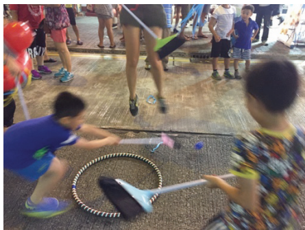
Figure 4/5: Late night engagement in the magic circle of Dragon Polo, Hong Kong (Mong Kok)/ Dragon Polo logo.

Only a few individuals disrupted our play: an old street artist asked us to stop the game every 5 minutes for his performance, for which he had to take a 30 meter in-run through our game field (he jumped through a hoop on a mattress). This gave the game a very spontaneous and volatile touch. At another point, a group of old men started a heated discussion with our Chinese team members. They didn't understand why we wouldn't want to play in a park, where we had more space, which should therefore be more fun for us.