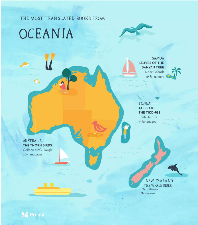
Fig. 1: The most translated books from Oceania