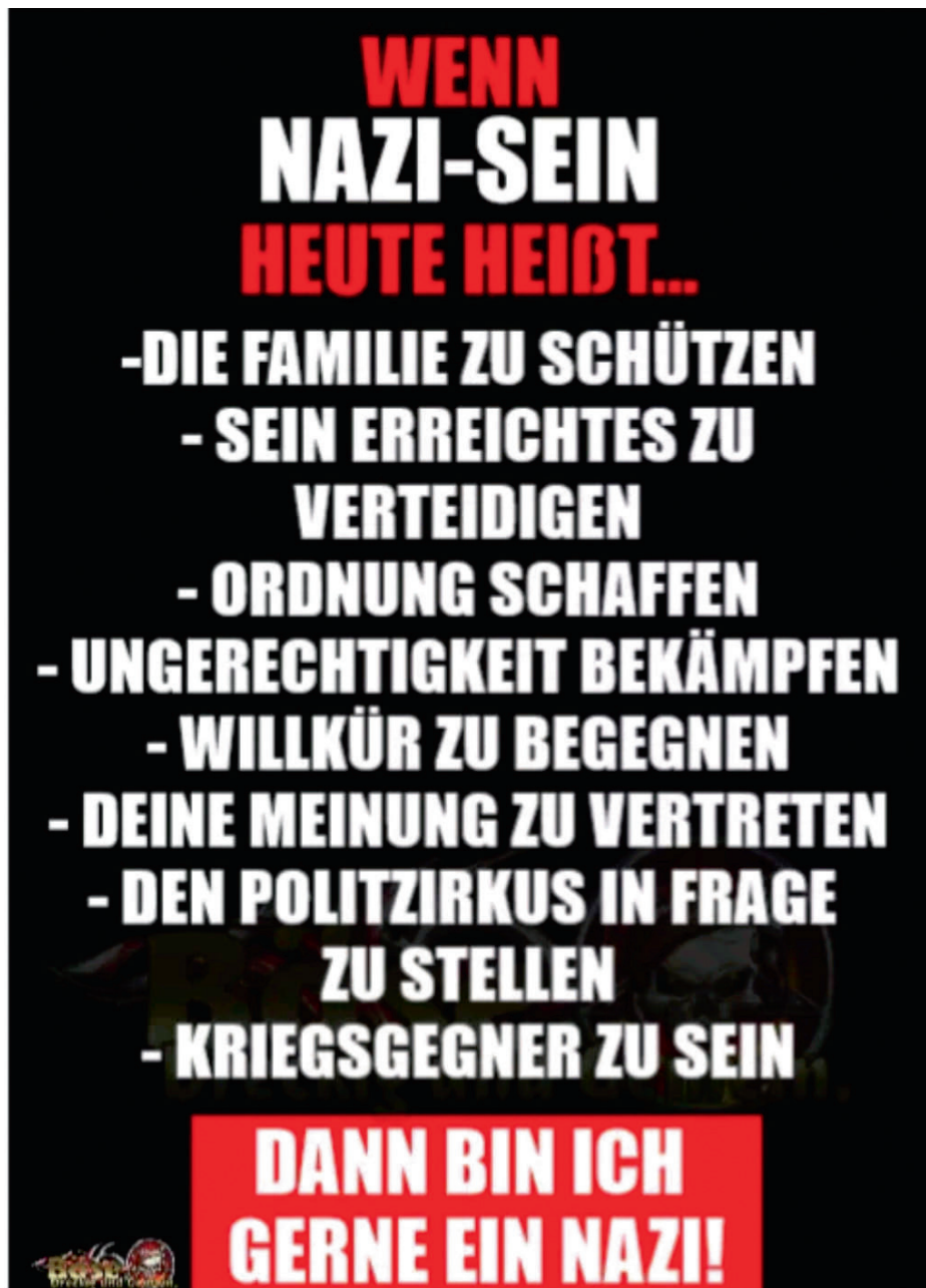
Figure 8. A meme taking advantage of the excessive use of the Nazi label

Note. Translation: "If today being a Nazi means to protect one's family, defend one's achievements, make order, fight injustice, challenge arbitrariness, have an opinion, question the political circus, and reject war, then I am happy to be a Nazi!"