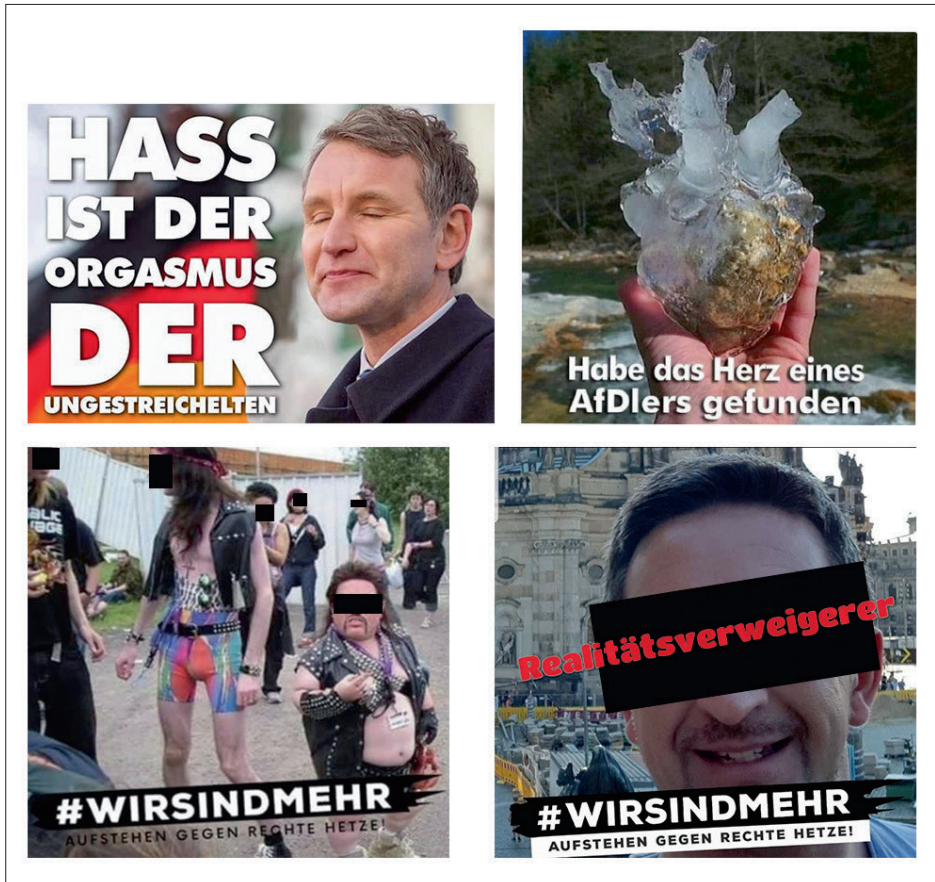
Figure 7. The antagonizing nature of the “logic of lulz” in a set of memes

Note. Translation top left: “Hate is the orgasm of the non-caressed” (picture: Björn Höcke, AfD politician). Top right: “I found the heart of an AfD supporter.” Bottom left: “#wearemore – stand up against right-wing hatred!” Bottom right: “Reality denier. #wearemore – stand up against right-wing hatred!” (subsequently anonymized).