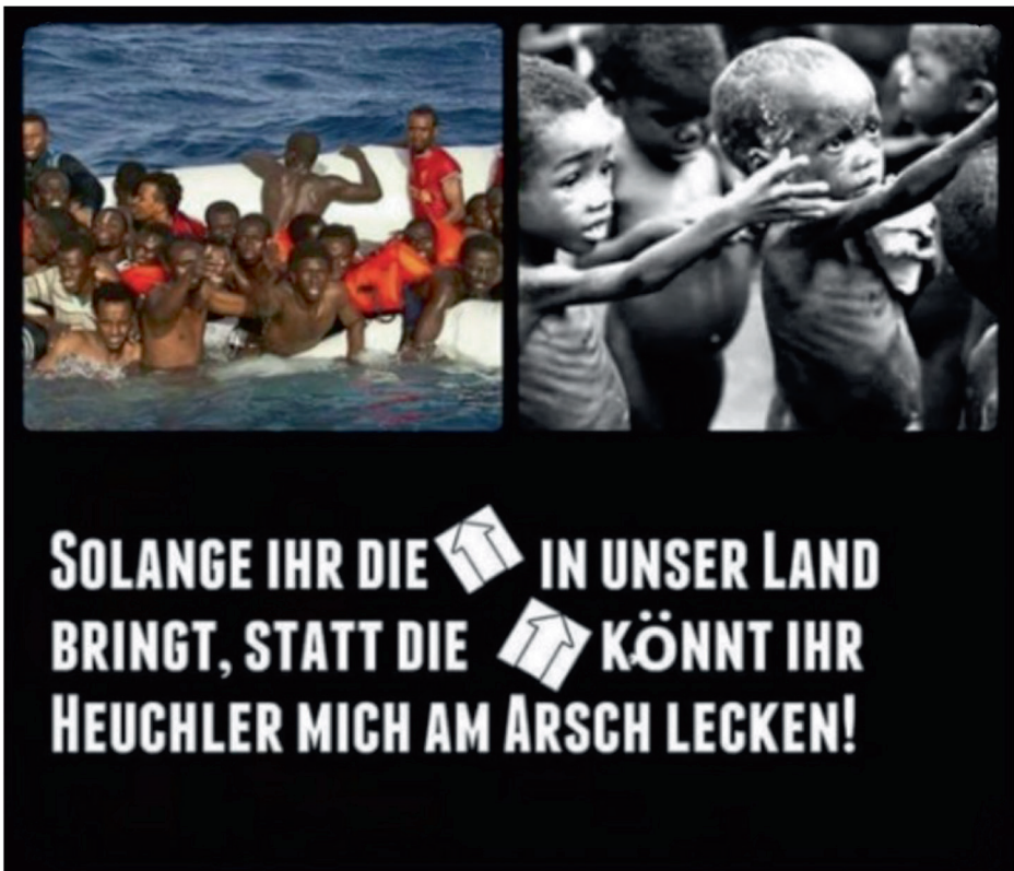
Figure 3. Anti-establishment and anti-refugee meme

Note. Translation: “As long as you bring them into our country instead of them, you hypocrites can kiss my ass!”