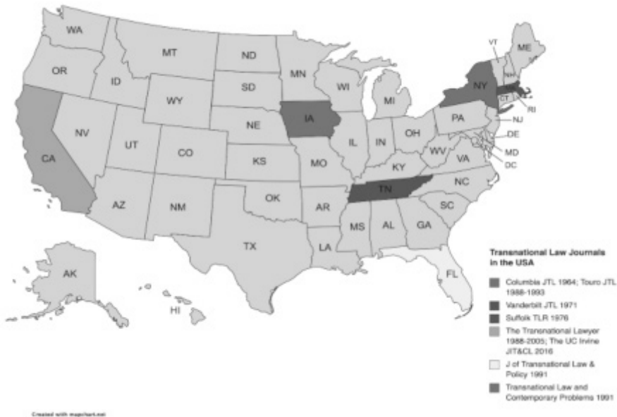
Map 1. Transnational Law Journals in the USA (1964-2024)

The second track of early US' student-run journals adopted, by contrast, the hybrid form of 'international and comparative law' journals, although this evolved to include other complementary denominations in their titles over time. While 'international and comparative law journals' (I&CLJs) were new to the US scientific publishing landscape at the time, they were, in fact, but the delayed progeny of the first periodicals that emerged in the wake of the gradual consolidation of the scientific discipline of international law in Western European countries in the last third of the nineteenth century. However, by the early 1900s, in Europe, three key factors had largely led to a fall of I&CLJs in Western Europe. These were, according to an earlier work, first, the 'consolidation of comparative law as a distinct branch of legal studies', second, the maturing 'professional and scientific independence of the discipline of international law itself' and, third, the 'emerging instrumentalist nationalisation of the study of international law and of national practice'. 26 It was only around four decades later that the founding of the International and Comparative Law Quarterly (ICLQ) 27 in London in 1952