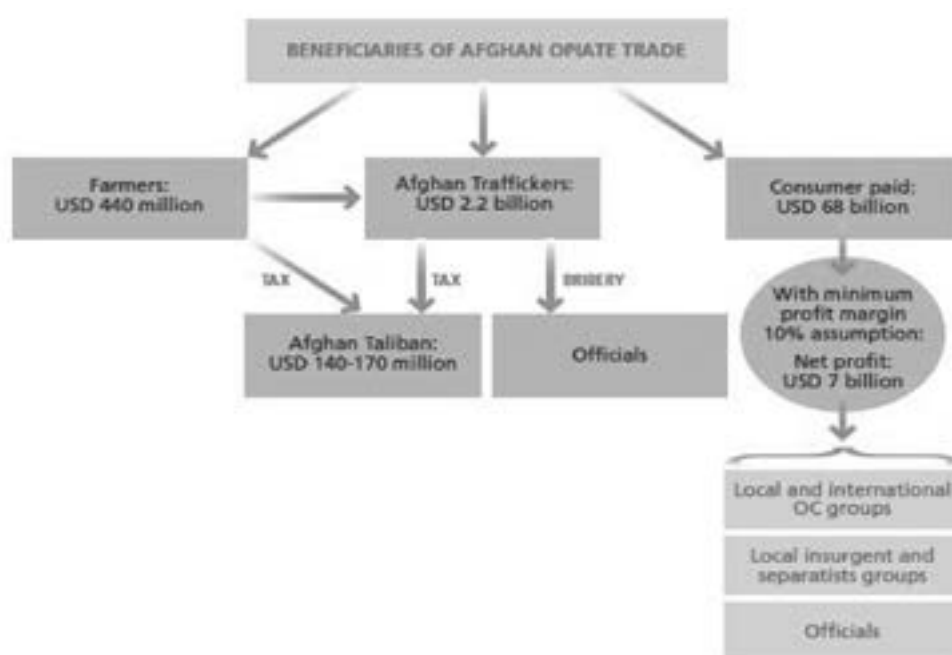
Overview of the beneficiaries of Afghan opiate trafficking, 2009 (UNODC 2011: 22).

It is more likely that the western donor countries will support Afghanistan with a limited development aid for alternative projects to reduce the drug economy after 2014. This is because