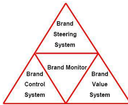
Figure 3.3: The four modules of the ACNielsen Brand Performance System.

based on a point score model. 498 Ten indicators in four categories are utilised in order to operationalise brand strength. These categories are market attractiveness (represented by market volume and market growth), penetration of the brand within the market (shown on the basis of current status and growth of market share (both in absolute and relative figures)), acceptance of the brand on the demand side (represented by brand awareness and existence of the brand in the so-called relevant set 499 ) and distribution rate of the brand. 500 The figures determined for each indicator are then transformed into a point score, whereupon the resulting scores are weighted with pre-defined factors 501 and as a next step totalled and scaled so that a maximum of 100 points can be attained. 502 The achieved percentage of this maximum score represents the absolute brand strength.