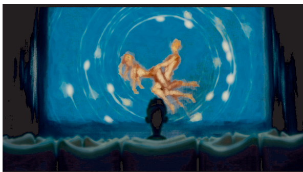
Figure 3: Heterosex in cinema (00:19:16)

these scenes receive a subversive efficacy, which is why the gaze established in these scenes can be described as queer.