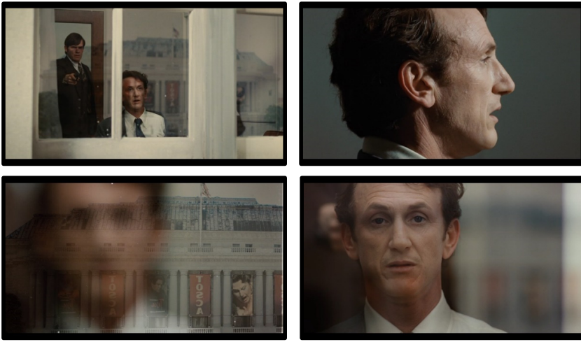
Figure 10: Milk's assassination (f.l.t.r. 01:51:07, 01:51:14, 01:51:20, 01:51:34)