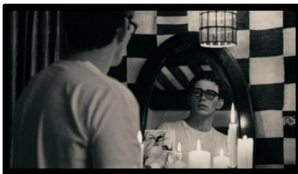
Figure 1: Looking into the mirror (01:11:56)

else is different and why I am different” (01:13:37-01:14:04). The alienation provided him with a perception of the world that seems to match the ‘gay sensibility,’ “coloured, shaped, directed and defined by gayness” (Babuscio 40).