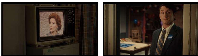
Figure 6: Bryant on TV (00:35:26 & 00:35:30)

perspective, they are set into the context of the life-threatening struggle the LGBTQIAN+ characters lead for their equality. Not only does this enhance a gay sensibility that the film seeks to convey, but also marks another offer to identify with Milk by suggesting his motives for fighting back Bryant's and Brigg's political campaign against homosexuals. Interestingly, despite following a clear good-versus-evil scheme that is innate to Hollywood films, directing the gaze towards the vindicators of the heteronormative system reverses the long tradition of the gay villain trope in cinema (cf. Russo 122). Questioning homophobic viewing habits, this gaze can hence be described as queer.