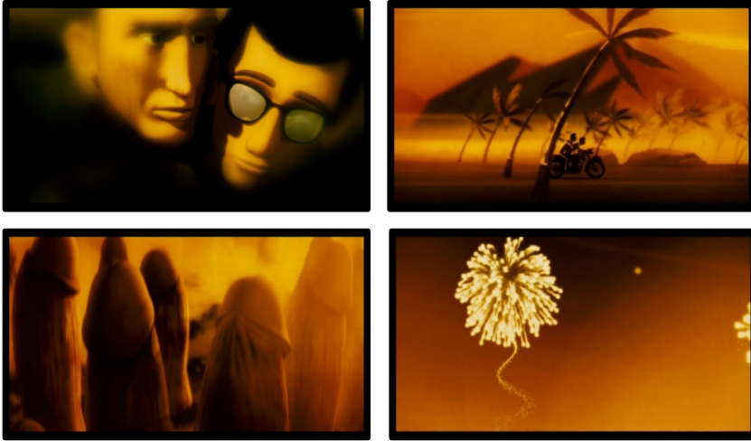
Figure 4: Homosexual intercourse (f.l.t.r.: 00:14:57, 00:15:08, 00:15:18, 00:15:19)

can only be described as a typical male gaze. Thus, these depictions of sexual intercourse in the film enforce rather than question heteronormative structures, eventually creating a homonormative aesthetic.