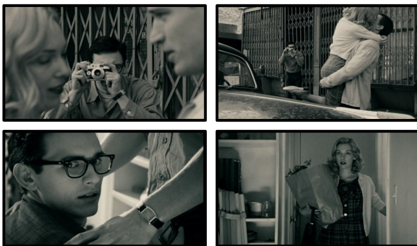
Figure 2: Hetero- vs. homosexual love (f.l.t.r.: 00:28:59, 00:29:32, 00:30:58, 00:30:59)