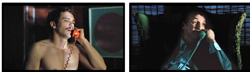
Figure 7: Last phone call (f.l.t.r.: 01:52:12 & 01:53:08)