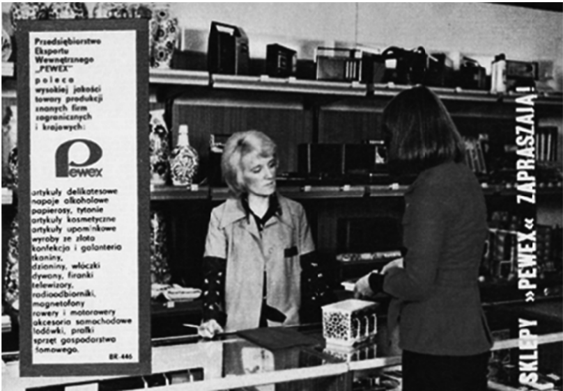
pic. 3: An original 1980s advertisement of Pewex stores from a weekly magazine “Motor”.