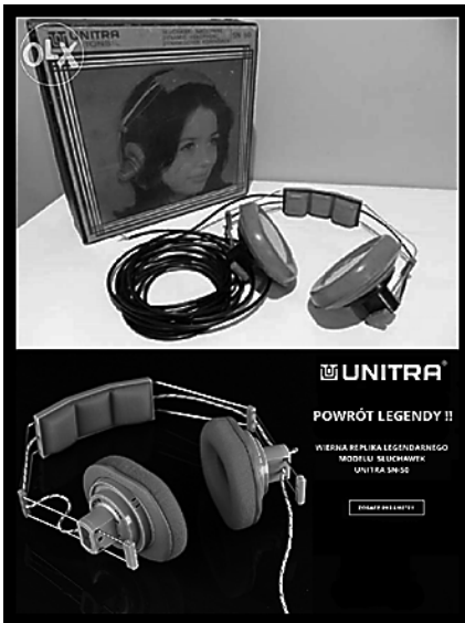
pic. 2: Original Unitra Sn-50 headphones and their 2014 counterpart advertised by the producer as a “faithful replica”.

(source: http://www.sklepunitra.pl/ ; http://olx.pl/oferta/sluchawki-unitra-sn50-oryginaln-e-opakowanie-z-gwarancja-z-1975r-CID99-IDaMohh.html#a7499357c9 )