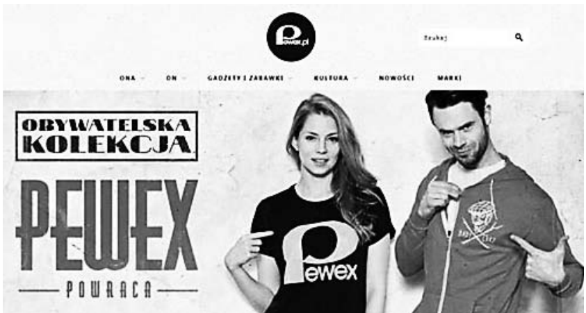
pic. 4: The main page of the Pewex.pl store with an advertisement of the ‘citizen’s collection’ which includes clothing with the Pewex logo

(source: http://www.ekonomia.rp.pl/galeria/706165,1,1072971.html#bigImage )