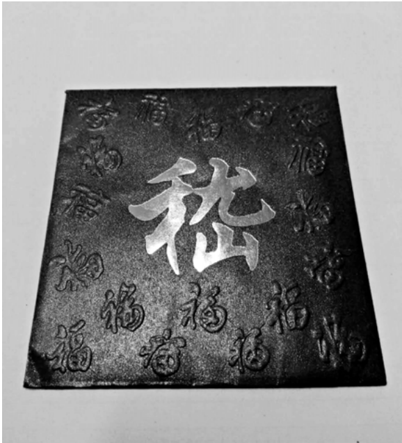
A red packet given to my nephews this year, bearing the word of my family name: Ji

When I was little, the most exciting thing about New Year was waiting for midnight on New Year’s Eve when my parents took out Red Packets to give to me—inside was brand new money. However, before they gave them to me, I had to say “gong xi fa cai, hong bao na lai”, which means: “I wish you a good fortune,