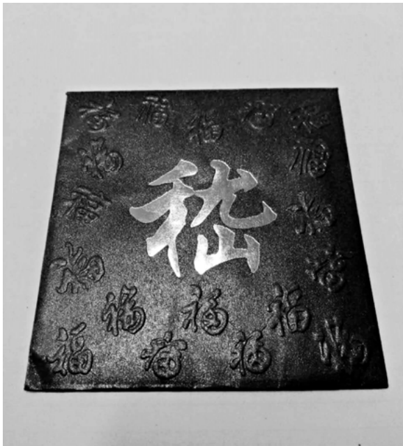
A red packet given to my nephews this year, bearing the word of my family name: Ji

When I was little, the most exciting thing about New Year was waiting for midnight on New Year’s Eve when my parents took out Red Packets to give to me—inside was brand new money. However, before they gave them to me, I had to say “gong xi fa cai, hong bao na lai”, which means: “I wish you a good fortune,