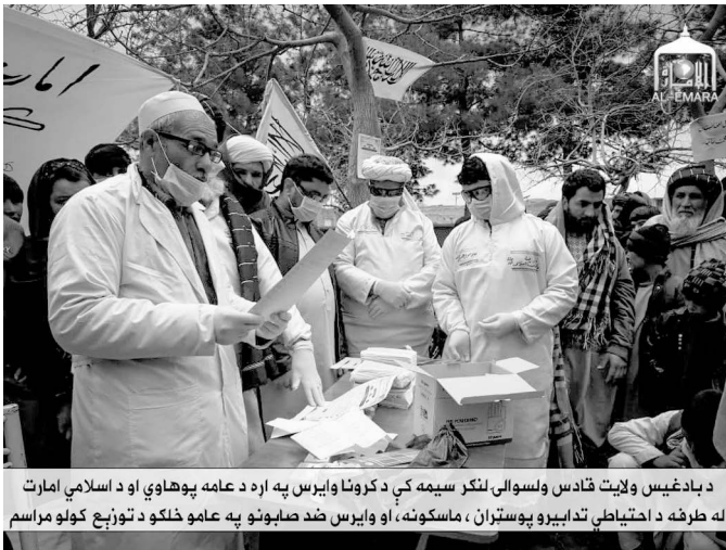
د بادغيس ولایت قادس ولسوالۍ لنگر سيمه کې د کرونا وایرس په اړه د عامه پوهاوي او د اسلامي امارت له طرفه د احتیاطي تدابیرو پوستران ، ماسکونه ، او وایرس ضد صابونو په عامو خلکو د توزیع کولو مراسم