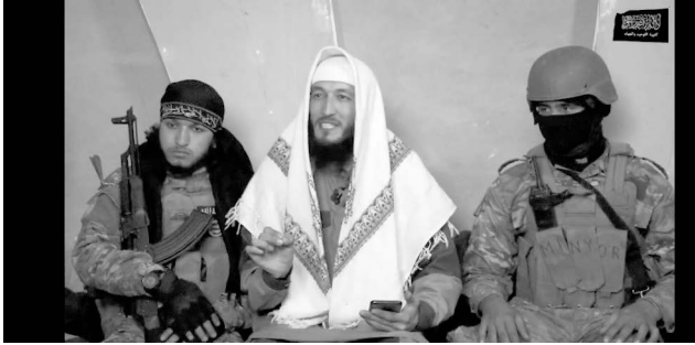
Screenshot from the video of Katibat al Tawhid wal Jihad, March 16, 2020, Telegram channel.