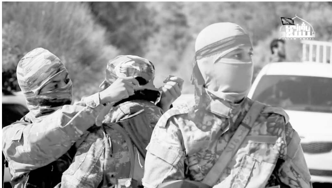
Joscelyn, Thomas (2019). 'Turkistan Islamic Party musters large force for battles in Syria.' | FDD's Long War Journal . June 29. URL: https://www.longwarjournal.org/archives/2019/06/turkistan-islamic-party-musters-large-force-for-battles-in-syria.php