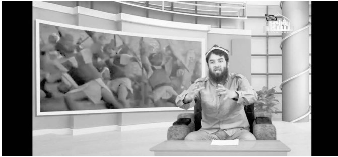
Screenshot from the video of the Turkistan Islamic Party's Media Center "Islam Awazi", February 29, 2020.