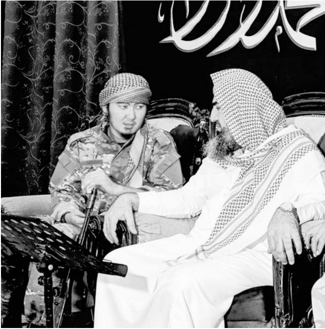
Image posted by Katibat Imam al Bukhari on its Telegram channel, February 2018.