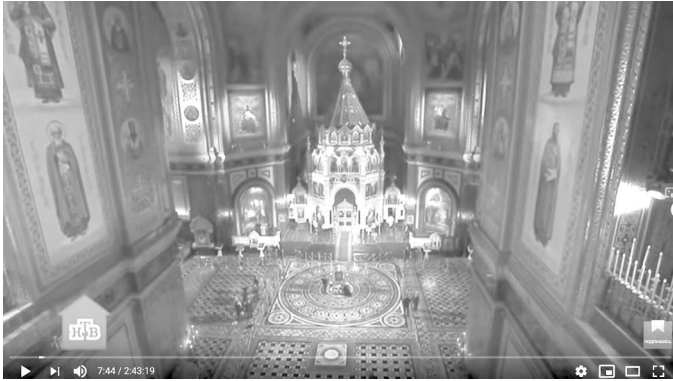
Image 2: Naked floor of the Cathedral of Christ the Saviour during the 2020 Paschal Liturgy