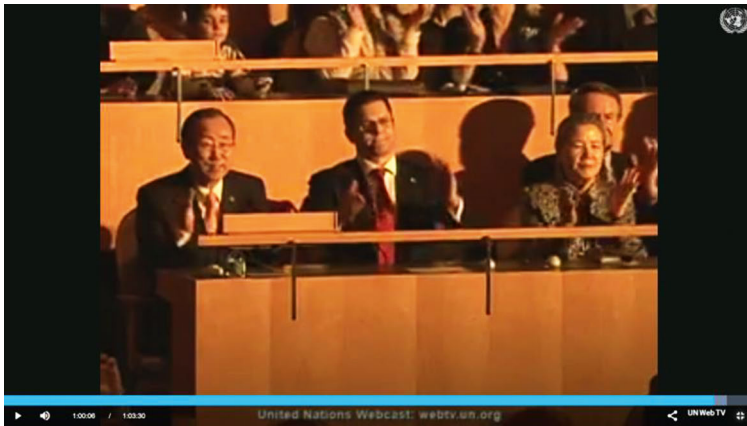
Fig. 11: Secretary-General Ban Ki-moon and General Assembly President Vuk Jeremić watch the Viva Vox Choir perform.

raised the issue again during the daily noon briefing by the Spokesperson for the Secretary-General, this time with specific reference to the fact that Ban was seen “applauding there” (“Daily Press Briefing”). On behalf of the Secretary-General, the spokesperson responded, “[w]e sincerely regret that people were offended by this song, which was not listed in the official programme. The Secretary-General obviously was not aware what the song was about or the use that has been made of it in the past” (“Daily Press Briefing”).