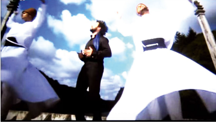
Fig. 4: A screenshot from the Hayko Cepkin episode of the Sufi Klipler project.

popularity. “Demedim Mi” was performed in almost every occasion possible, frequently with the accompaniment of whirling dervishes as reflected in the video, shown in figure 4. That the hymn was parodied in Selçuk Aydemir’s 2011 movie Çalgı Çengi (Musician and Dancer) testifies to its great popularity.