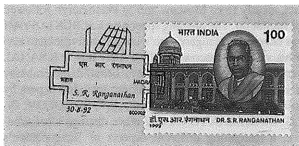
Ranganathan Stamp with first day cover