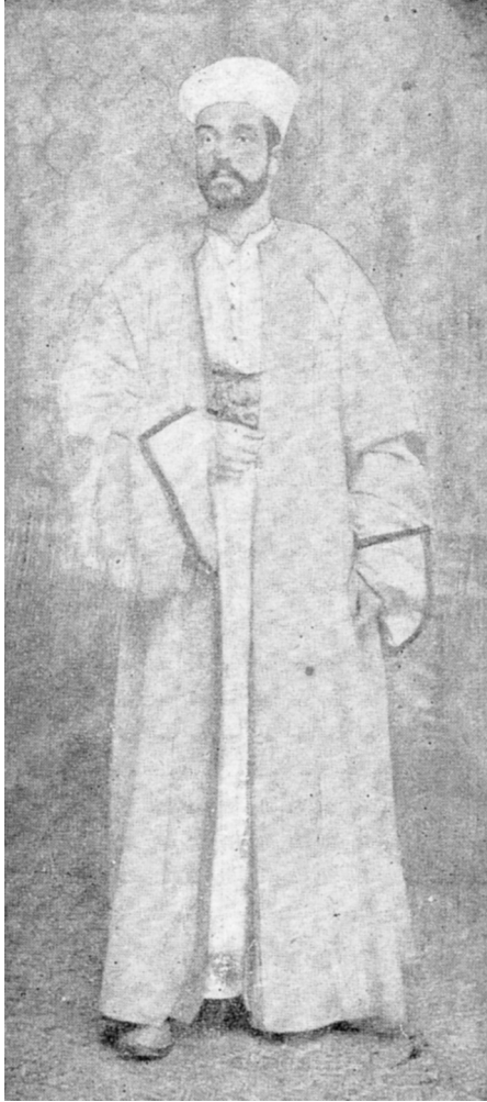
Fig. 20.1: Ḥasan Tawfiq al-‘Adl in the dress of a religious scholar when meeting the German Kaiser in Berlin, c.a. 1892.

German Kaiser, yet he used the title efendi and appeared in a suit and tarboushin in the 1895 picture of Dar al-‘Ulum’s faculty.” 36