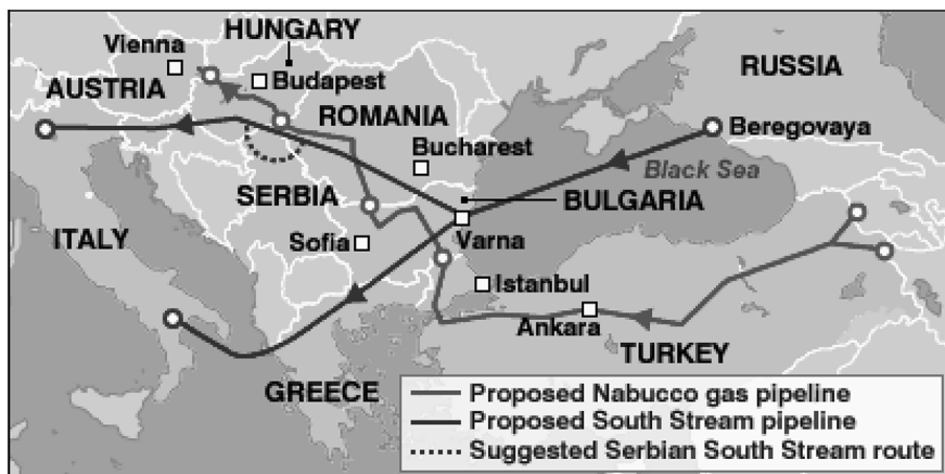
Figure 2: Planned courses of Nabucco and South Stream gas pipelines

envisioned to lie along the course of the Nabucco pipeline are also part of the South Stream proposal, all of which are clearly recognisable from Figure 2.