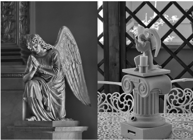
Figure 2. A statue of an angel in a church in Helsinki (left) and CeleSTE (right)

These challenges and such feedback significantly influenced the development of the new design for CeleSTE ( Celestial Theomorphic device ). Addressing the misconception of the robot being an idol, the design was altered by making the figure bent on one knee in an act of prayer. Moreover, its appearance moved away from the "sanctity" of a saint and adopted a more intercultural and slightly interreligious angelic look. This reduced characterisation supposedly associates the robots less with a sacred sphere, which may compensate for the aforementioned problem of fallibility.