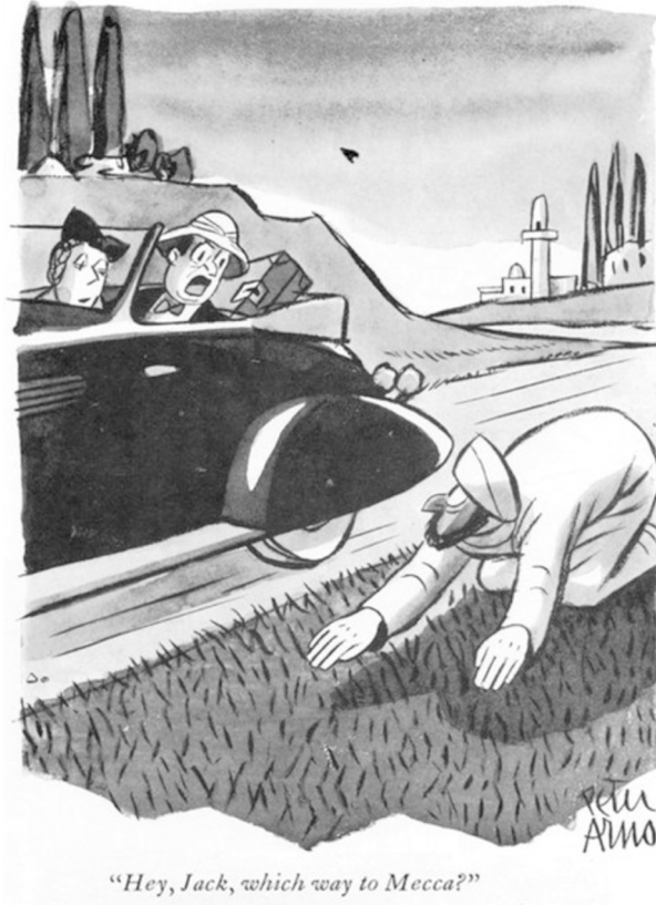
Figure 15: Cartoon by Peter Arno, published in The New Yorker , April 9, 1938.

Which Way to Mecca, Jack? is predominantly read as a paradigmatic product of such self-distancing dynamics. According to literary critic Evelyn Shakir, Blatty's narrative turns the pain of discrimination and exclusion into an almost "burlesque" 14 mocking of himself and his Arab family background. Reading the text as an autobiography instead of looking closely at the fictional ways in which the supposedly humoristic writing deals with the painful experience of racist discrimination and the conflicts of West-Eastern image repertoires, Shakir sees