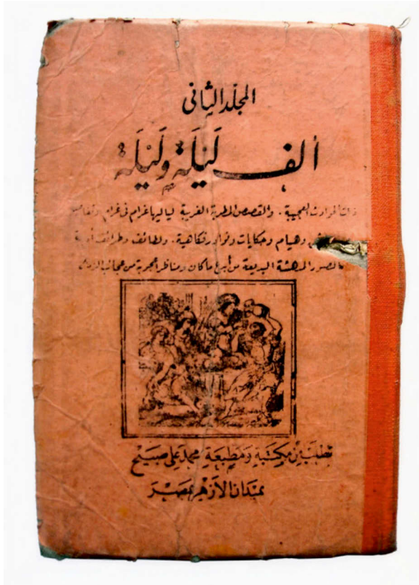
Figure 25: Arabic edition of the Arabian Nights ; detail from Jacir's mixed media installation Material for a Film , 2005–ongoing.

cluded to the point that Palestinians “are invisible people.” 185 Therefore, the very act of creating and circulating a narrative or an image that proves the existence of Palestinians becomes a form of political resistance: “Facts do not at all speak for themselves, but require a socially acceptable narrative to absorb, sustain, and circulate them.” 186 Said’s argument has inspired numerous writers and film makers, who created what Hamid Dabashi coined Palestinian “aesthetic of the invisible.” 187 Ma-