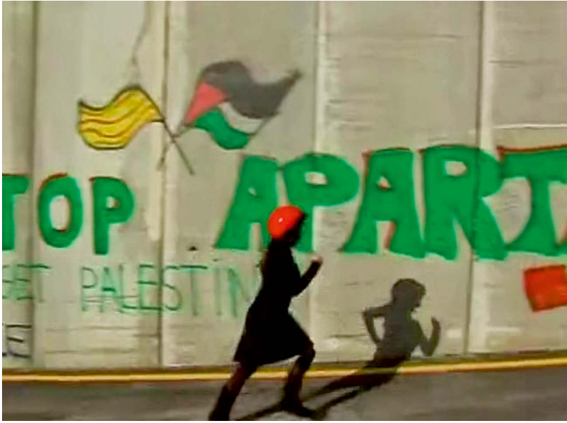
Figure 29: Film still from Larissa Sansour's 2:17 min. video, Run Lara Run , 2008.

equally extreme and sad representation of Palestinian deterritorialization, a filmic hyper-compensation of repressed powerlessness that willingly loses control over its feet on the ground.