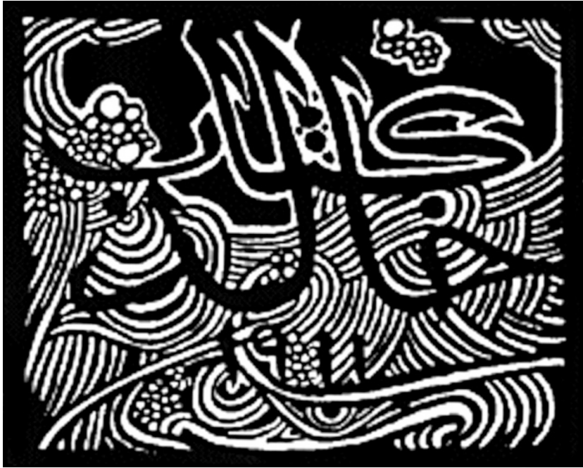
Figure 7: Detail from the cover illustration by Kahlil Gibran for Ameen Rihani's The Book of Khalid , 1911. This illustration shows in Arabic letters the novel's title, Kitab Khalid , as well as the year of its first publication. The illustration could alternatively be interpreted as showing a fragment of the cover of the fictional/original Khedival library manuscript that the literary narrative claims to be based upon. 121

Often sectarian in their editorial composition and readership, periodicals like Al-Hoda (Guidance), Kawkab Amrika (The Planet of America), Miray'at al-Gharb (Mirror of the West), or Al-Funun (The Arts) functioned as particularly important platforms for the formation of a distinctive transnational “public sphere linking mahjar to mashriq .” 122