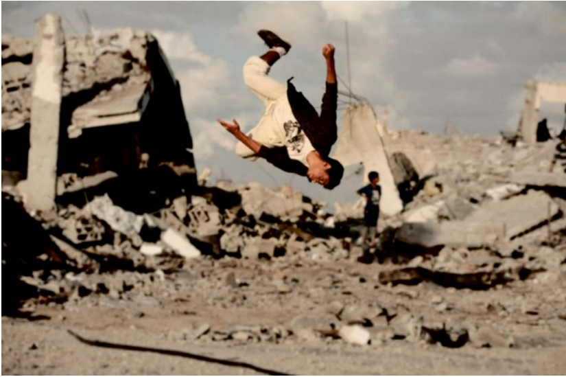
Figure 30: Member of Gaza Parkour performing in Gaza, 2014.

as well as in exile, have given up waiting for a just solution between equals, though the international community still speaks of the need for mutual compromises.