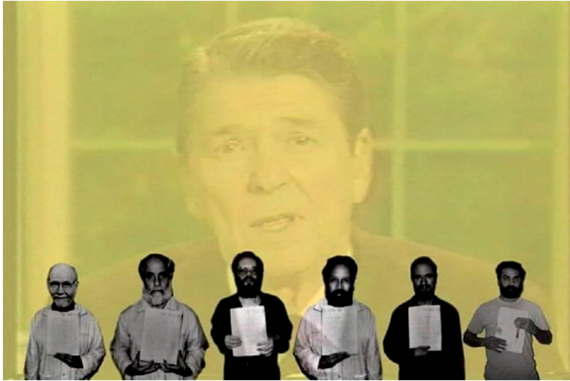
Figure 20: Film still (06:27 min) from Hostage: The Bachar Tapes (English Version) , Tape #17, dir. Souheil Bachar, The Atlas Group in collab. with c-hundred film corp, 2000.

produces and collects objects and stories that cannot be examined through the conventional binary of fiction and nonfiction. It demonstrates that the way we construct our cross-cultural imaginaries does not do justice to the complex experiences of those imagined. Furthermore, Raad urges us to see his documents not as based on any one person's actual memories but on "fantasies erected from the material of collective memories." 171 These documents do not function as scraps of historical evidence. The faked documents are presented as art-facts rather than as artefacts. Functioning as artistic traces between what is known to be true and what has to be believed from a certain political, ideological, or cultural point of view, Raad's art exposes the performative genesis of (cross-cultural) meaning: "It is also important for us to note that the truth of the documents we research does not depend solely on their factual accuracy. We are concerned with facts, but we do not view facts as self-evident objects that are already present in the world." 172