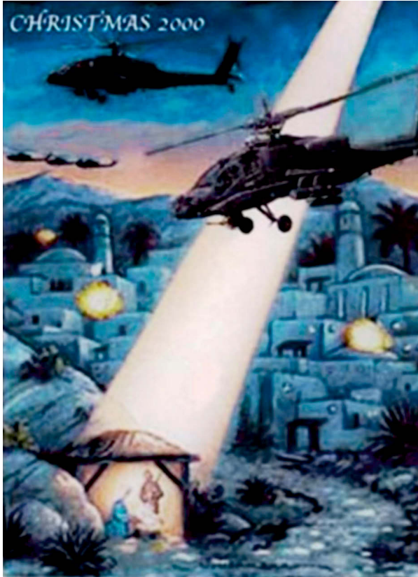
Figure 21: Emily Jacir, Christmas 2000 , Christmas greeting card, c-print, 2000.

of the Palestinian activist, poet, writer, and translator, Wael Zuaiter (fig. 23), who was killed at the age of 38 by Mossad agents in Rome on October 16, 1972. While the PLO representative himself had always renounced political violence against civilians, he was suspected of being a member of the militant group, Black September, responsible for the Munich massacre of Israeli athletes during the 1972 Summer Olympics. His murder marked the beginning of a series of secret retaliation attacks and assassinations perpetrated by Israeli intelligence against Palestinian activists in the Western diaspora. The details of what really happened in Rome have never been clarified.