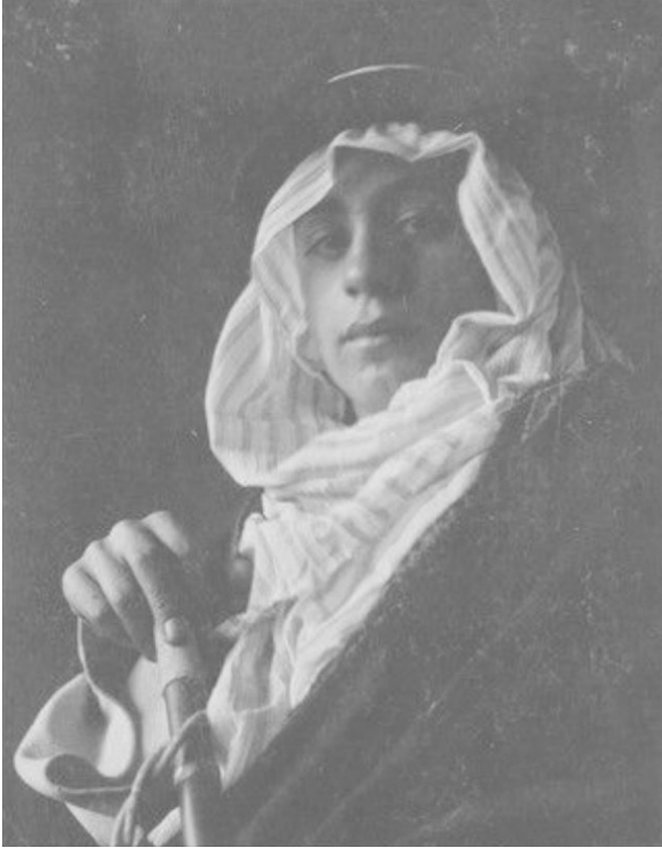
Figure 11: Photographic portrait of Gibran by Fred Holland Day, ca. 1897.

related post-moralistic question regarding the instable gap between the morally illegitimate affirmative use of Orientalist signs and their post-moralistically justifiable resistive insertion.