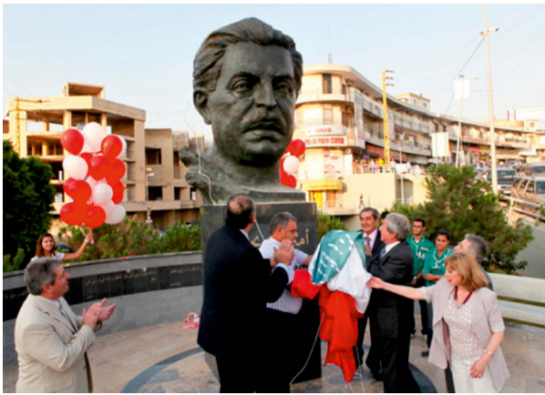
Figure 3: The unveiling of a large bust of Ameen Rihani in the presence of the Lebanese ministers of culture and education, parliament members, and other representatives. Metn region, Lebanon, on 28 July 28, 2011.

In 2007, William McGurn, a Wall Street Journal editorial writer and chief speech-writer for US president George W. Bush, rediscovered Rihani as a genuine Arab champion of American-style global freedom and democracy and as a powerful rhetorical vehicle to promote Arab-American political, economic, and military collaboration in times of the nation's global war on terror. McGurn stumbled upon Rihani's name while reading an openly anti-Arab book by Michael B. Oren, Israel's would-be ambassador to the United States, and in January 2008, persuaded Bush to use a short, second-hand quote from the Ar-Rihaniyat for one of his speeches