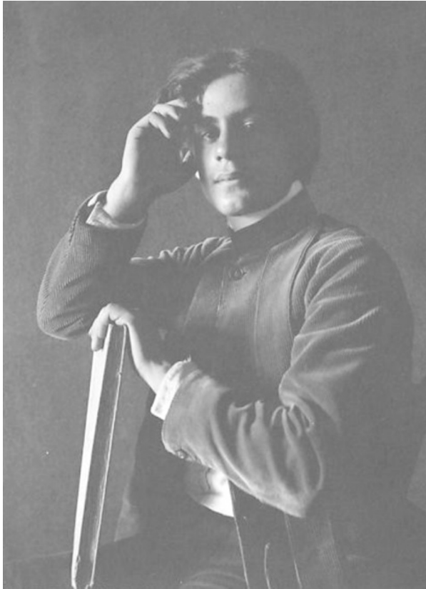
Figure 12: Photographic portrait of Gibran by Fred Holland Day, 1897.

eccentric understanding of photography as an allegorical artistic practice. The co-founder of the progressive publishing firm, Copeland and Day, was a close friend of Oscar Wilde and Stephen Crane. As the mentor to avant-garde photographers like Alvin Langdon Coburn and Edward Steichen, he was a central figure in artistic circles on both sides of the Atlantic. Since Day began making photographs in the late 1880s, he saw himself determined to promote photography as genuine fine art practice. By the turn of the century, he had established an international reputation as a key figure in the so-called pictorialist movement. This approach to photography embraced labor-intensive processes such as platinum prints, which yielded rich, tonally subtle images. It emphasized the role of the photographer as craftsman and countered the argument that photography was solely a mechanical