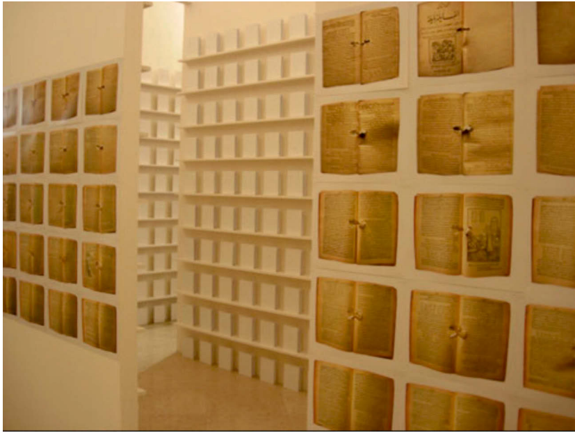
Figure 27: Emily Jacir, Material for a Film , mixed media installation, Biennale of Sydney, Zones of Contact, 8 June–27 August 2006.

function simply as scraps of historical truth. Having witnessed the performative production of the perforated blank pages, we cannot know if the artist is manipulating her other materials as well. In order to interpret this work, one needs to acknowledge first of all that one is confronted with matters of act rather than with matters of fact, with Tat-Sachen , in German, rather than with Tatsachen . The Sydney performance explicitly stages the difference between the two. Jacir's work does not simply narrate Palestinian truths against hegemonic histories, thus leading to the contrapuntal harmony of an extended archive. Archival dissonance is not dissolved into any higher order. Her performative acts and conceptual exhibitions function as reminders that real experiences sometimes need to be re-formed or even perforated in order to be believed by others. The project creatively adapts and then extends the Saidian insight that facts do not speak for themselves: It explores both the procedures of memory and the strategies of making meaningful statements. The respective performative approach in an attempt to arrive at an objective view of a lost or obscured truth is not that of maximum detachment, in the Freudian sense, but of personal and subjective re-attachment.