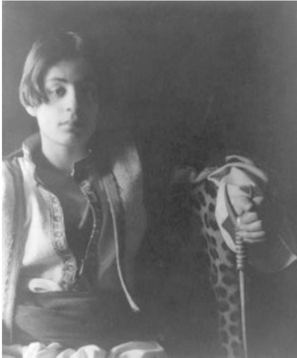
Figure 10: Photographic portrait of Gibran by Fred Holland Day, ca. 1895.

boy's defenseless body staged in front of the studio-camera, the significantly dissimilar depiction of Gibran with a book in his hands, dressed in the costume of a self-learning patrician student (fig. 12), already anticipates the young reader's later career as an artist and literary writer. Gibran's own drawing (fig. 13), projecting the poetically engrossed self-image of an intellectual pilgrim and religious mystic wrapped in white cotton drapery, seems to selectively combine both poles of the earlier photographs' pictorial semantics. In this drawing, the visual trope of the beautiful Arab/Bedouin boy appealing to Western sexual fantasies has apparently made room for the iconic consolidation of more spiritually oriented Orientalist desires. Taken together, the four images allow for visually tracing the history of the self-Orientalizing merchandizing brand that the world-famous artist and poet would become. In my view, they can open up an alternative perspective on the fine line between strategic self-Orientalization and the (self-)exploitation by or of Orientalized people. In addition, these images invite the spectator to discuss the