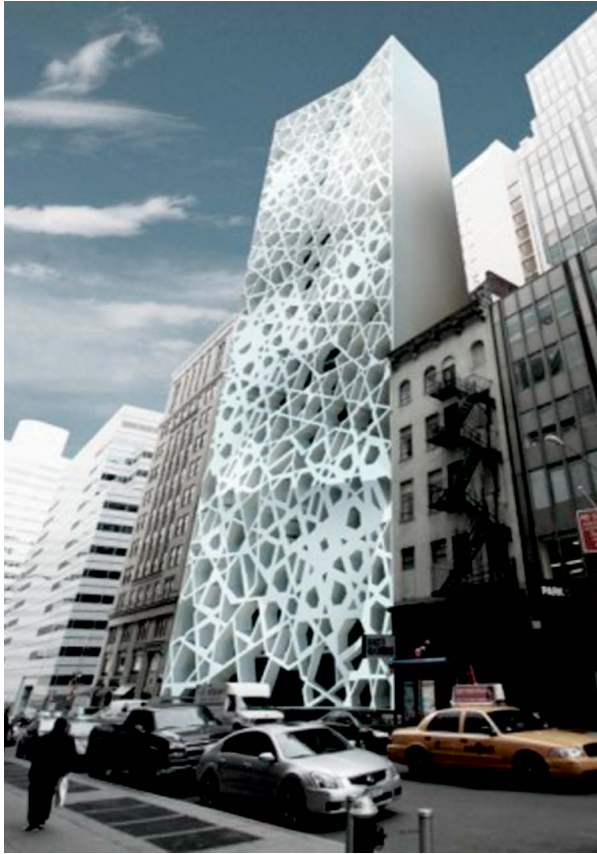
Figure 5: Rendering of Park51 Muslim Community Center by SOMA Architects, 2010.

equally self-critical and ironically mocking “confrontational imaginary.” 28 Such a reading of The Book of Khalid sees in it a double vision of multiple broken belongings, failed exchange, and destructive revenge rather than—as most critics want to have it—a literary immigration by way of self-orientalizing ingratiation or a pioneering fictional bridging of East and West in the name of tolerance, inter-cultural dialogue, and mutual understanding. 29