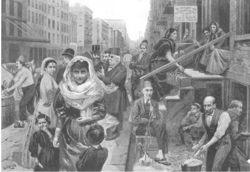
Figure 6: The Syrian Colony, Washington Street, undated drawing by W. Bengough of a turn-of-the-century New York street scene not far from the spatial focus of the debate over the Park51-project.

By using Spivak's text on terror as a point of departure, I defect from Geoffrey Nash's interpretive script at the same time. The renowned scholar of Arab writings in English is quite aware that "[t]here are of course multiple ways of reading Ameen Rihani's Book of Khalid ," 30 ranging from biographical and contextual approaches to perspectives with a focus on intertextuality and linguistic innovation. But although he aims at revealing his own reading from the dominant Orientalist and anti-Orientalist interpretive chains of either celebrating the novel for its cross-cultural bridging and synthesizing capacities or blaming it for the failure of that very synthesis, Nash's interpretation of the novel as a representation of "the secularization of the Arab soul" completed through "the Muslims' migrations of the twentieth century" 31 plays out the very essentialist construction that strictly divides between