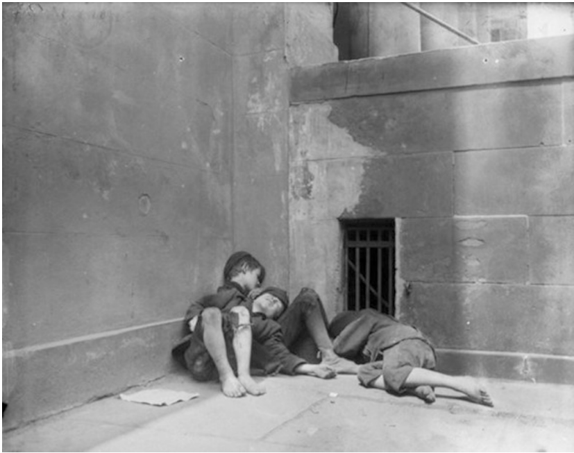
Figure 9: Jacob A. Riis, Street Arabs in Night Quarters , 1888–89, photography.

either/or-fixation of abstract Anglophone Arabness. Khalid's constant juxtaposing of discursively presumed ontological being and de-facto performed cultural self-making radically questions the truth claim of any pre-figurative Arab identity. His abortive immigrant story instead stresses the inescapably performative modality of being Arab within and against those codes that have prefigured dominant Western perceptions of how Arabs are supposed to feel, think, and act. Even when he finally takes up the role of the Arab prophet, he is not willing to mask this masquerade's internal contradictions. The narrative of Khalid's many selves instead highlights the subversive power of performative contradictions. His decisively politicized and frankly ludicrous interpretation of the imprisoned prophet figure has little to do with the distilled exotic trope of the dignified Oriental mystic-prophet for which Gibran opted. It is this insight into what Jacob Berman calls the "sophisticated strategies of figurative self-representation," 142 as a tropic and performative tool of strategic subversion, critical revision, and correlative identification, that characterizes many Anglophone Arab representations after Gibran.