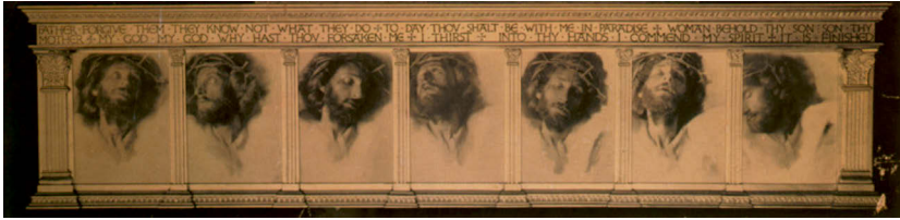
Figure 14: Fred Holland Day, The Last Seven Words of Christ , 1898. Series of self-portraits as Christ with crown of thorns.