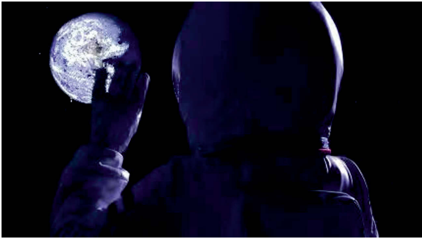
Figure 32: Larissa Sansour, Space Earth , 2009, 45 x 80 cm, c-print.

Without using a single image of a soldier, a checkpoint, a wall, or a refugee camp, A Space Exodus emphasizes the traumatically exilic condition of the Palestinian people, unheard by the international community and threatened to fade into nothingness. At first glance, the work seems to portray Palestinian deterritorialization and loss exclusively in outer space. By doing so, however, it directs our attention to a very real and earthly struggle. The audio-visual exodus narrative does not represent Palestinian pain and trauma as an end in itself. The project needs, rather, to be seen as an artistic act of resistance. It is simultaneously a non-violent and translocal act. By taking the local struggle for dignity into the global art market, it voices the Palestinian demand for the world to overcome ignorance and the almost unconditional acceptance of military occupation and settlements that are blatant violations of international law. In this view, the work should be