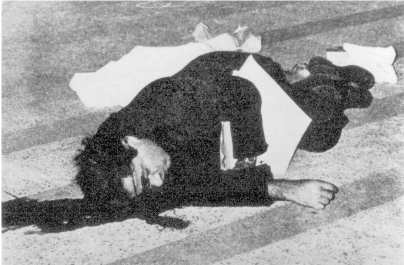
Figure 24: Wael Zuaiter's corpse after his assassination in Rome on 16 October 1972; detail from Jacir's mixed media Installation Material for a Film, 2005–ongoing.

Nights , 183 translation (any translation) is necessarily a mistranslation: a polemical act of translating against other translations, of imposing one's interpretation over another and thus outdoing other translators. In this view, Jacir's performance symbolically re-enacts the violent prevention of a strategic and, maybe, polemic Palestinian translation. It performs the deadly prevention of the resistive appropriation of the Nights by a Palestinian activist-intellectual. The particular symbolism at work here combines the Palestinian experience of violence with the Shahrazadian trope of resistance and the Borgesian notion of translating against.