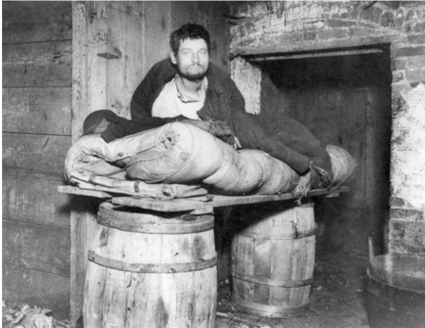
Figure 8: Jacob A. Riis, A Peddler Sits on his Bedroll , 1888, photography.

In these visual and textual narratives, Arab immigrants appeared as forming an ethnically unique group of poor illiterates who, despite their culturally determined “wild independence” 140 and “biblical code of ethics,” 141 nevertheless worked hard to climb the social ladder and enter the American mainstream. Khalid inhabits exactly this role and thus acts as a representative of the hegemonic narrative’s essentialism. At the same time, he disrupts the linear discourse of diagnosing socio-cultural shortcomings and prescribing unconditional assimilation. His repeated inversion and reversal of the Arab street figure and his sturdy multiplication of alternative self-identifications far beyond that figure do not allow for any