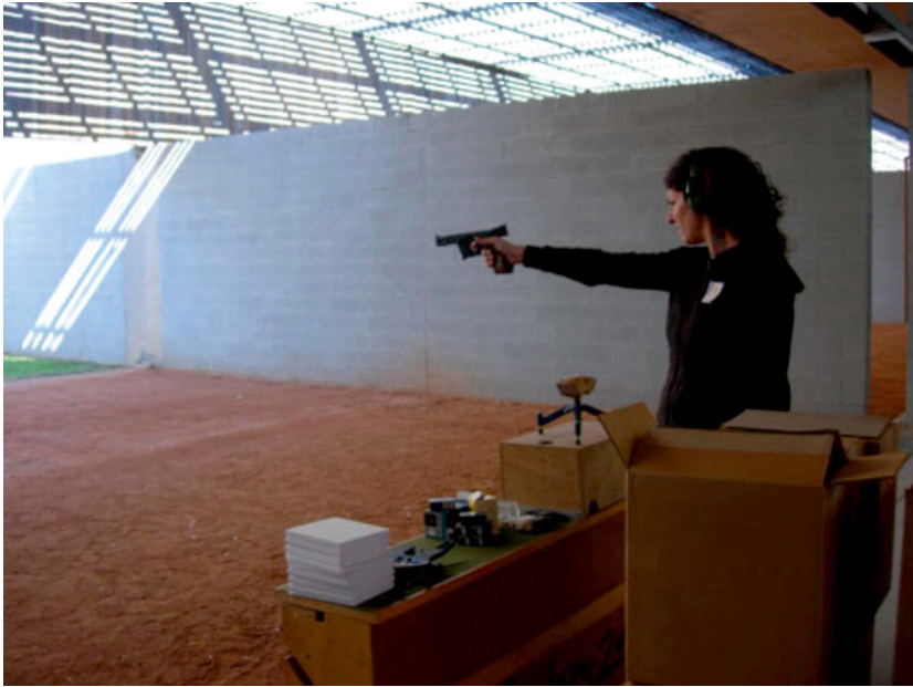
Figure 26: Emily Jacir, Material for a Film , performance 1000 blank books shot, 2006. Biennale of Sydney, Zones of Contact, 8 June–27 August 2006.

Material for a Film is influenced by this aesthetic attempt to make visible what has been hidden. In addition, Jacir's project can be linked to the trans-local resistance strategy of the Palestinian novelist and theorist, Ghassan Kanafani. Until his murder in 1972, the editor of the Beirut-based magazine, Al-Hadaf , called upon Palestinians to first analyze how representational regulations affect the almost unconditional acceptance of military occupation and to then take the local struggle for liberation into the civic domain of Western representation. Jacir's work draws on both Kanafani's concept of resistance literature ( adab al-muqawama ) and Said's permission-to-narrate imperative. It documents, preserves, and narrates the Palestinian experience.