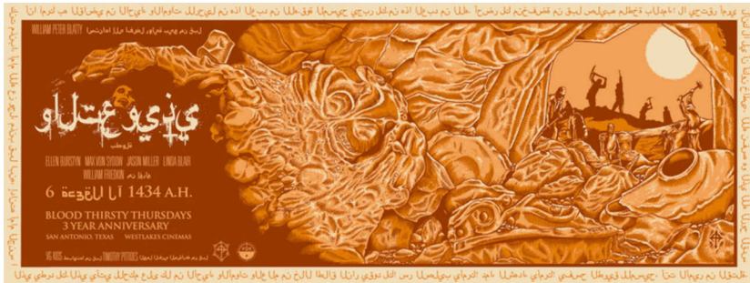
Figure 17: Movie poster by Timothy Pittides, 1976. Designed for the three-year-anniversary screening of William Friedkin's filmic adaptation of The Exorcist .

and that “its dominion was sickness and disease.” 44 The local Arab characters placed in a surrounding blazed by an inexorable sun seem to be the living embodiments of Pazuzu’s execration. They are represented as an “ancient debt.” 45 Grinning with their “damply bleached” 46 eyes, “rotted teeth,” and “sagging cheeks,” they make the “chawaga [the Western foreigner]” feel “strangely alone.” 47 But even as he “fixed his gaze on a speck of boiled chick-pea nestled in a corner of the Arab’s mouth,” 48 the American is interested in something “totally other.” 49 What he is looking for is “that Other who ravaged his dreams.” 50 The demon which possesses the American girl Regan and which Merrin tries to exorcise is precisely that Other.