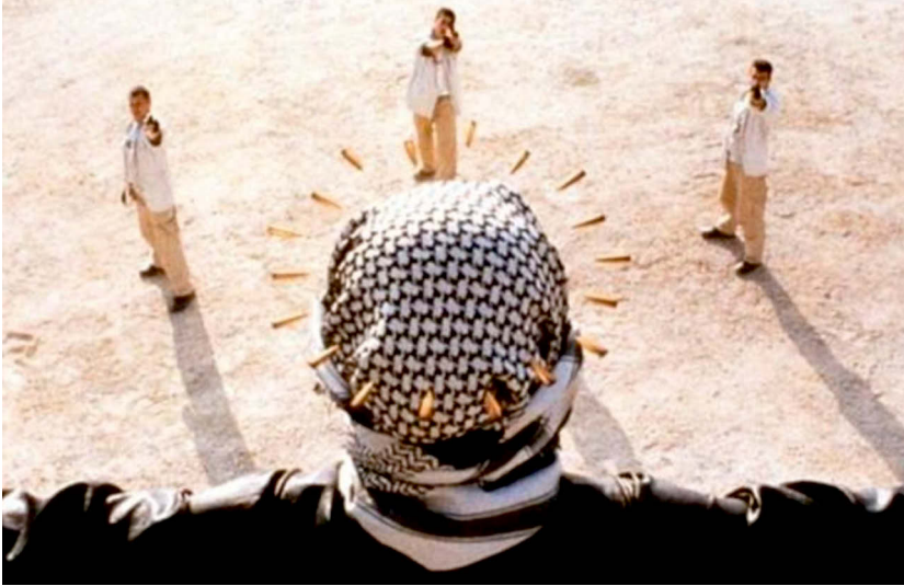
Figure 28: Film still from Elia Suleiman's 92 min. film Divine Intervention , 2002. The sequence shows the main protagonist E's Palestinian Ninja fighter fantasy.

to run free (fig. 30). Founded in 2005 after the withdrawal of the Israeli army, this is, to my knowledge, the oldest organized parkour team in Palestine. Unlike most traceurs of the Western metropolises, the group directly links its sport of overcoming obstacles in its own post-/war urban setting to the political goal of liberation. Mediated into the world via internet, its members' free-running practice adapts the free-style philosophy of getting from one point to another as quickly and efficiently as possible to a situation where free movement is virtually impossible. What is elsewhere the imitation of a matter of survival here advances to an expression of survival within the prison-like situation of the so-called Gaza strip. Drawing on military training, parkour was innovated by French free runners in the 1990s as a cultural lifestyle of athletic performance. In Palestine, this performance functions as a cultural act of sumud : an act that transposes a unique poiesis of resistance. 221