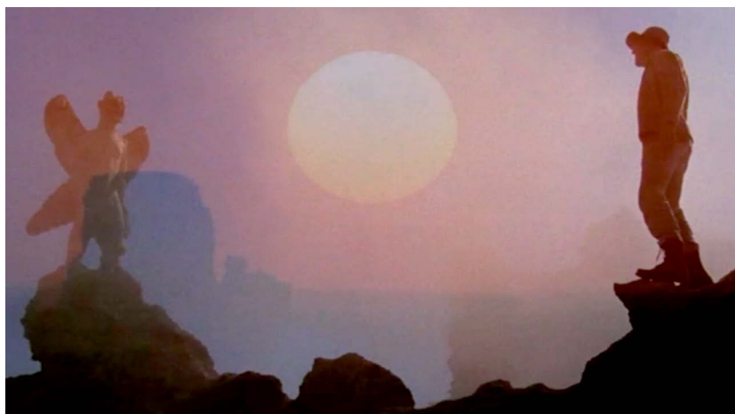
Figure 16: Merrin facing Pazuzu in Iraq. Film still from the prologue's cross(-cultural) fade; The Exorcist , 1973.

already invaded the girl, and the distant horror gradually enters the filmic home-setting.