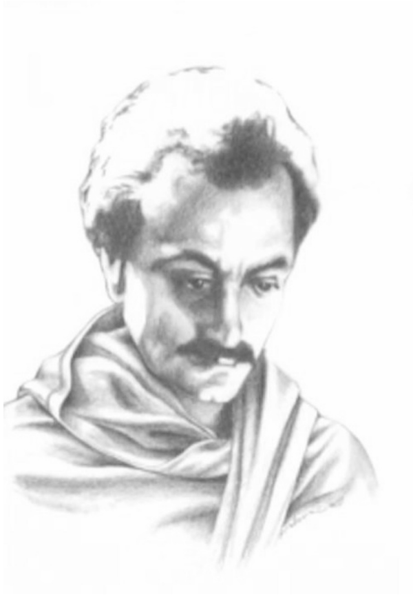
Figure 13: Kahlil Gibran, Self-portrait (drawing from the 1930s).

mimetic medium. Pictorialist photographic works instead claimed to be produced like any painter's canvas and to be as skillfully constructed as any graphic artist's rendering. Day had mounted the first important exhibition of American pictorial photography in 1900 at the Royal Photographic Society in England but was never affiliated with any American artist group. 147