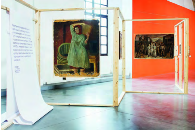
Figure 67: Boychukism: Great Style Project