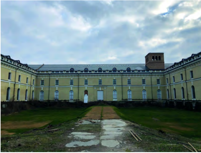
Figure 63: The courtyard of Mystetskyi Arsenal