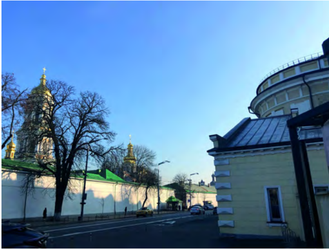
Figure 62: The Kyiv Pechersk Lavra (left) and Mystetskyi Arsenal (right)

view from Lavrska Street, November 2021.