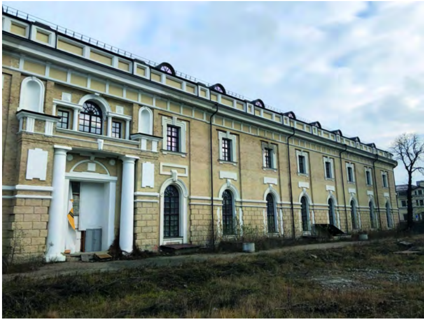
Figure 64: Mystetskyi Arsenal, details of the façade

It is common for imperial regimes to make powerful symbolic use of the physical environment, and architecture or urban design can often be manipulated in the service of politics. 21 In the early 18th century, when Peter I built the fortress, Kyiv had great military and strategic importance, as it was an outpost of the western part of the Russian Empire. And when Catherine II planned the erection of an arsenal on the territory of the fortress (the decree was signed in May 1783, and construction took place between 1784 and 1803 22 ), the empire was embroiled in wars. Still, the massive construction was distinct from the area's architecture, dominated by a baroque style that culturally connected to the period of the Cossack Hetmanate (Figs. 64–65). 23