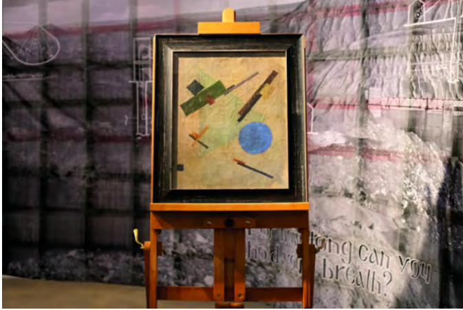
Figure 66: MALEVICH+, Mystetskyi Arsenal , 09 June–09 August 2016