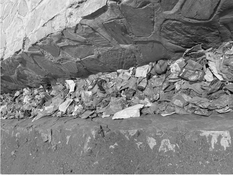
Fig. 1: Blocked sewer, Misisi, Lusaka, October 2022

And even though the impacts are felt locally in the city and need to be resolved, it is also important to involve international and national actors and their requirements (cf. Taylor 2000: 408). Dealing with MSW is also addressed directly and indirectly in the international 17 United Nations (UN) Sustainable Development Goals (SDGs) e. g., in SDG 6: Clean water or sanitation or SDG 12: Responsible consumption and production (cf. UN in Zambia n. d.). To achieve the SDGs, global and local actions must be implemented. An overview of the concrete targets in Lusaka and their impact on the SDGs can be found in the Annexure 9). Also various national initiatives address this complex waste topic either through the objective of a sustainable economy: “Africa by 2063 will have been transformed such that natural resources will be sustainably managed and the integrity and diversity of Africa’s ecosystems conserved” (African Union Commission 2015: 34) or directly as a defined goal “We, therefore, undertake to achieve (...) interconnected (...) Circular Economies that are sustainably developed (...)” (Southern African Development Community (SADC) 2020: 5).