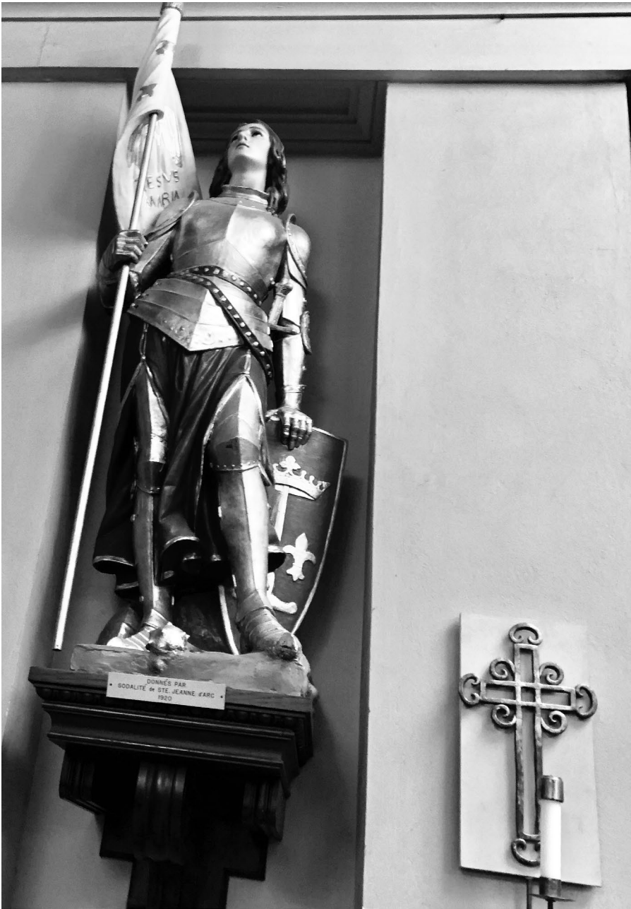
Figure 9: Brown-eyed and brown-haired Joan of Arc in the Cathédrale Saint-Louis, Roi-de-France or St. Louis Cathedral (largely in its current form since 1850) in the French Quarter of New Orleans, Louisiana. Standing figure donated by the Sodalité de Sainte Jeanne d'Arc in 1920. October 2018.