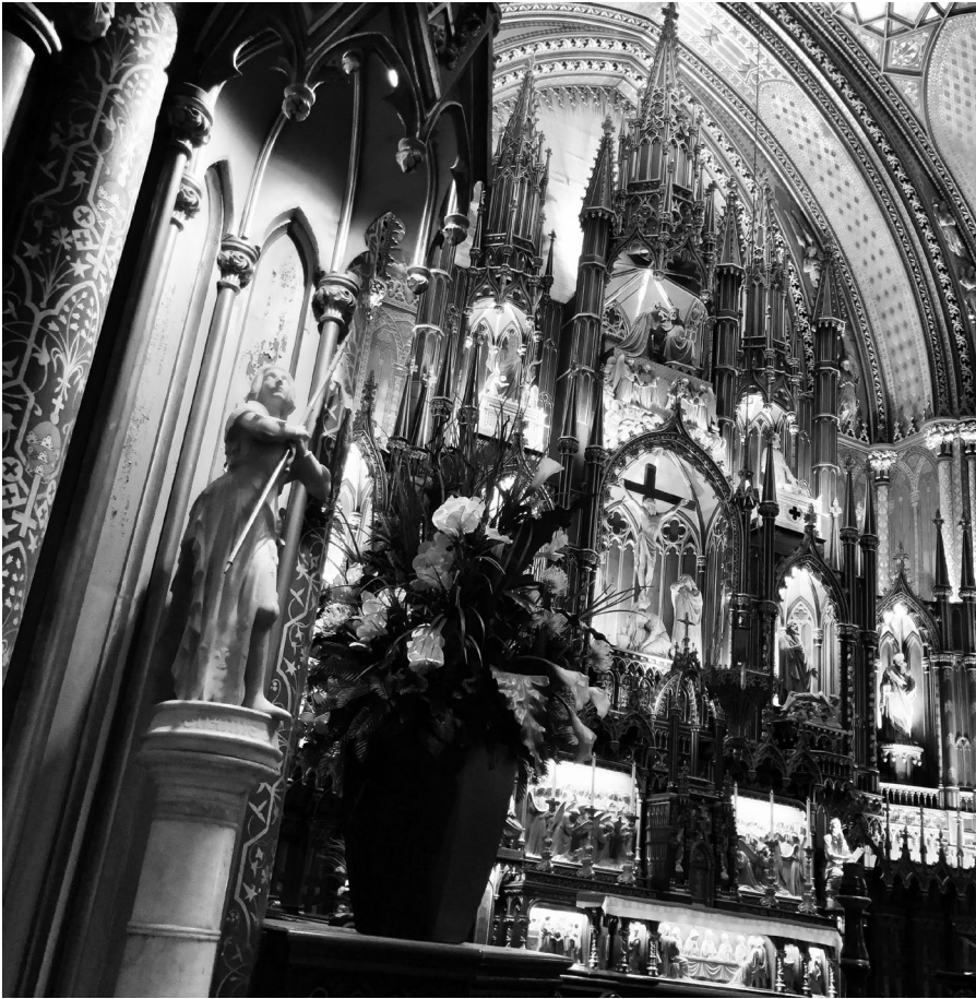
Figure 10: Sculpture of Joan of Arc standing next to the altar at the Basilique Notre-Dame de Montréal in Old Montreal, Québec, a masterpiece of Gothic Revival architecture. May 2018.

for the Chinese half of us.” 79 Informing her proud mother afterwards that the siblings “won the battle,” the narrator awakes in the morning shouting lyrics to “Sound the battle cry” — a hymn laden with chivalric imagery. 80 Alluding to anti-Chinese violence through this tale of childhood harassment, Sui Sin Far uses medieval imagery to express a racialized dual identity. Internalizing “white savior” tropes of progressive missionary uplift, she imagines a chivalric white self who fights on behalf of another self that is vulnerable and Chinese.