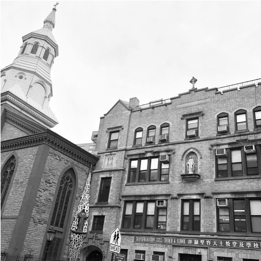
Figure 4: Transfiguration School, Catholic parochial school associated with the Church of the Transfiguration on Mott Street in New York's Chinatown. Situated in a formerly Irish and Italian immigrant parish, the church now serves the largest Catholic Chinese-speaking congregation in the US. November 2019.

tion accusing Chinese men of corrupting young white girls. 37 Throughout the European Middle Ages, “blood libel” traditions (false stories accusing Jews of murdering Christian children to use their blood in religious rituals) incited violence against Jews that continued for centuries, and in his own day Wong addresses how the so-called “rat libel” with its vilifying associations of social corruption contributes to violence against Chinese. 38