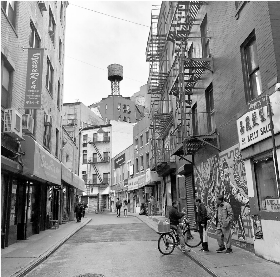
Figure 5: Doyers Street (between Pell Street and Mott Street) in New York's Chinatown today. Wong Chin Foo lived near here and describes Mott Street vividly in "The Chinese in New York" (1888). April 2019.

the environment in and around Mott Street, offering an autoethnographic corrective to white-authored accounts of Chinatown travel. 39 Assuming the position of a "native informant" while strategically employing an objective third-person voice, Wong discusses Chinese hygiene and grooming, religious worship, food preparation, and rich food traditions—dismantling myths of eating rats and opium consumption. "The hygienic functions of cooking elevate the kitchen director in China to high social status," 40 Wong states, noting the quality of dining in New York's Chinatown: "There are eight thriving Chinese restaurants which can prepare a Chinese dinner in New York almost with the