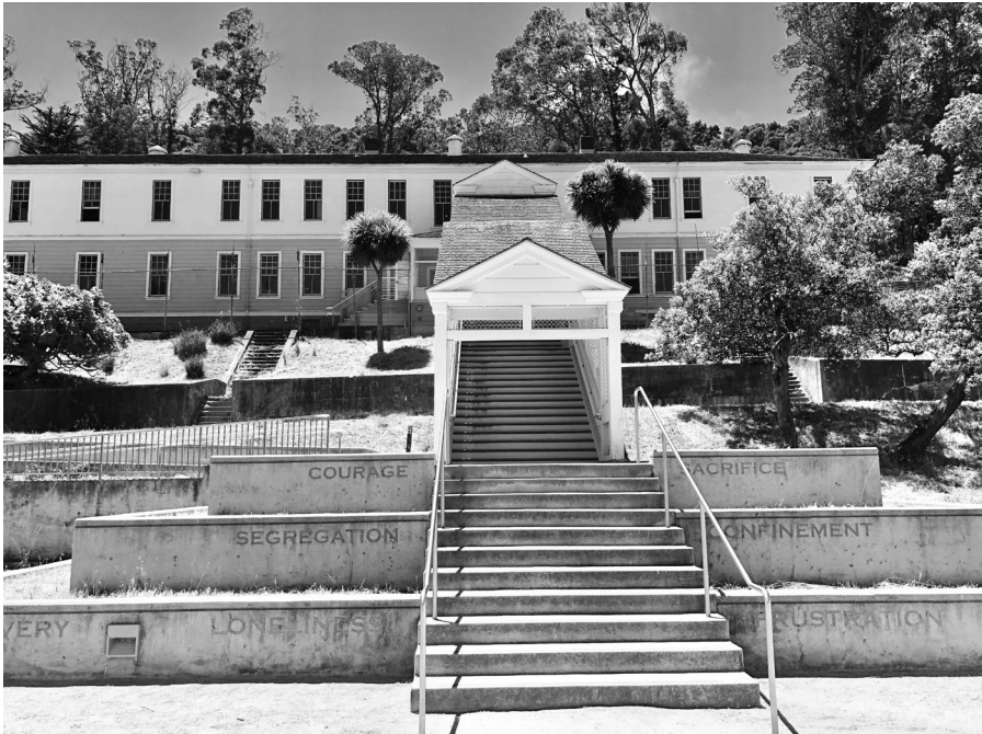
Figure 6: Two-story wooden barracks at the former US Immigration Station at Angel Island in the San Francisco Bay. It operated as a detention center primarily for Chinese migrants from 1910–1940, and the restored site is now a National Historic Landmark. July 2019.

THIS CHAPTER COMBINES medieval literary analysis and ecocriticism to consider the poetic corpus (hundreds of lyrics) that Chinese detainees carved into the wooden walls of detention barracks of the Angel Island Immigration Station, a site in San Francisco Bay currently registered by the United States as a National Historic Landmark due to its cultural significance. Located in waters a boat ride away from the city of San Francisco, CA, this so-called “Ellis Island of the West” was where many newcomers from Asia were processed as they sought entry into the US and it also operated as an immigration detention center from 1910–1940. The majority of the detainees were Chinese with some staying as long as months or years before being deported or “landed” (granted entry into the US). Thick with literary allusions and references to imprisonment and injustice in Chinese myths and literary classics, the mostly anonymous and untitled