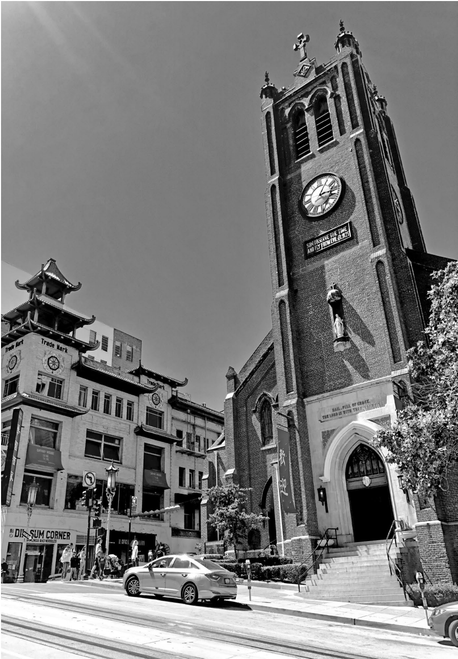
Figure 3: Old Saint Mary's Cathedral and Chinese Mission, San Francisco's Chinatown. Built in Gothic Revival style ca. 1854 on stone foundations from China, the church stands across from the Sing Chong Building built in "Oriental" style just after the 1906 earthquake. July 2019.