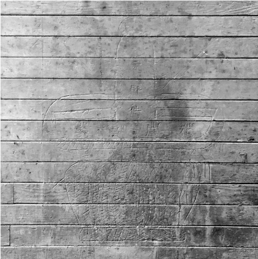
Figure 8: Faint sketch of an ancestral shrine (with multiple family surnames) carved into a wall on the second floor of the former barracks of the US Immigration Station at Angel Island in the San Francisco Bay. July 2019.

Angel Island” poem cited previously is accompanied by a poem that primarily uses identical Chinese characters as its end-rhymes. The response poem begins: 同病相憐如一身 [...] (“I sympathize, the same illness, as if we shared a body...”), and the use of shared rhymes across the two poems formally embodies somatic empathy. 43 A simple drawing of a shrine on the second floor of the barracks creates a “surrogate space” of community with family names sharing an ancestral connection, and elsewhere sketches of ships and houses evoke previous journeys and hometown villages. Crowded writing all over the barracks evokes the immediate context of interrogations as well. Crammed with tiny text, ephemeral “coaching books” helped paper sons and daughters prepare for interro-