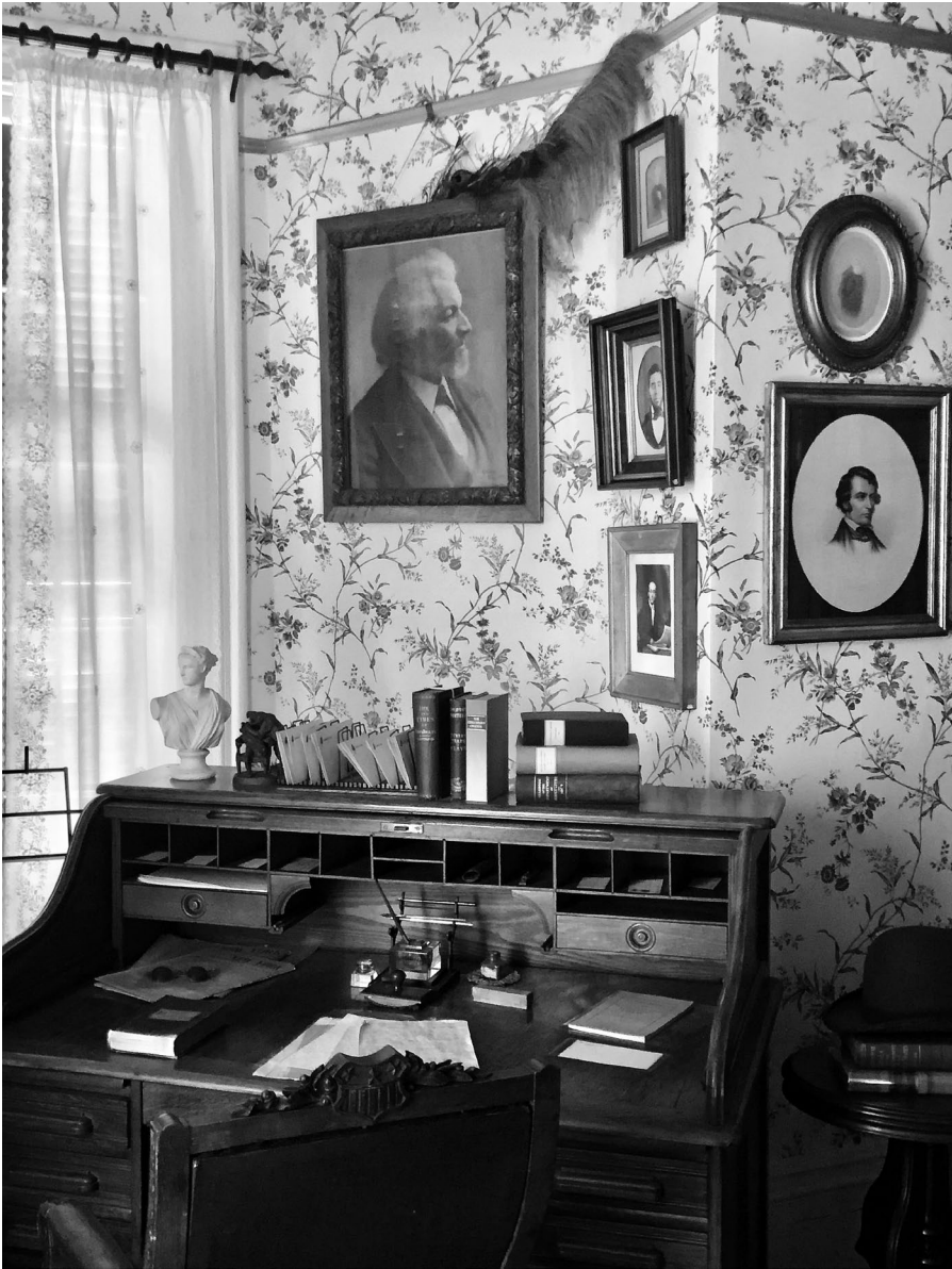
Figure 1: Writing desk of Frederick Douglass in his Gothic Revival residence at Cedar Hill in the Anacostia neighborhood of Washington, DC. His library, preserved much as it was upon his death, includes editions of the works of Sir Walter Scott, historical romances, and slave narratives. Frederick Douglass National Historic Site. December 2019.