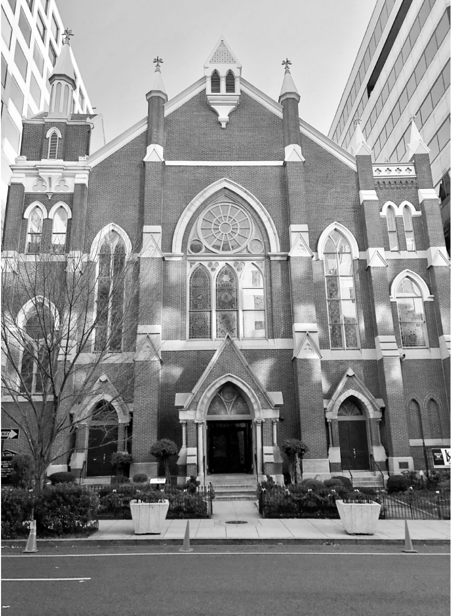
Figure 2: Metropolitan African Methodist Episcopal (AME) Church, featuring grand Gothic arches and stained glass. Frederick Douglass attended this church throughout his residence in the city and his funeral was held here in 1895. Washington, DC. December 2019.