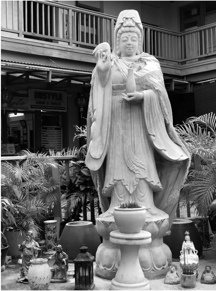
Figure 11: White-robed statue of Guanyin and other female deities in Honolulu's Chinatown. Honolulu, Hawai'i, November 2017.

of a “little bird with a white breast” outside the window with Sin Far “extending ... a blossom from a ... lily plant” at the threshold of a feminized domestic space might suggest to Christian readers the white lily flower so often associated with the Virgin Mary in European literary and artistic traditions, especially representations of the Archangel Gabriel’s appearance to Mary in the Annunciation. 94 Foregrounding fully humanized Chinese characters, this story offers a syncretic and ambiguously racialized annunciation scene. Mermei sits indoors while Sin Far arrives with a “lily” betokening good news. The queer intimacy of this moment also tweaks heteronormative scripts of erotic love, casting Sin Far as the Archangel Gabriel and Mermei as a disabled and deformed Chinese