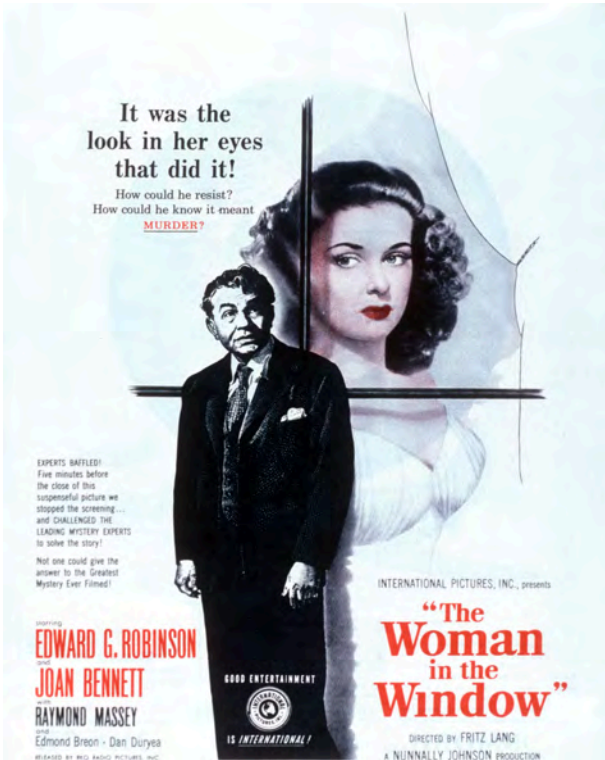
Fig. 1: A poster for THE WOMAN IN THE WINDOW

unexpected to be spoiled for anybody who hasn't seen the picture. After your own great thrill you'll know what we mean.”