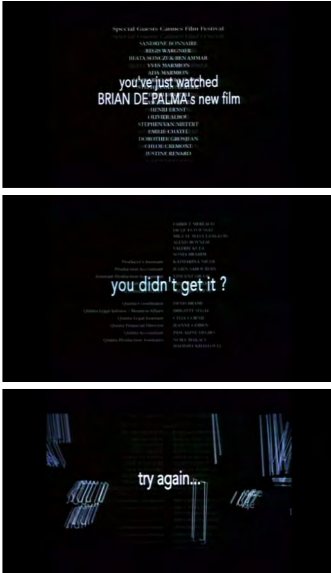
Fig. 4a-c: The trailer for FEMME FATALE

with the words “You’ve just watched BRIAN DE PALMA’S new film. / You didn’t get it? / Try again...” (fig. 4a-c). In a way then, the trailer has shown all but revealed nothing.