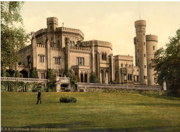
Schloss Babelsberg in Potsdam between ca. 1890 and ca. 1900. Photochrom print.

Schinkel, these two elements (his creative genius and his extreme diligence) were fatally combined with a third element, rarely occurring with genius artists – his managerial function at the Prussian Building Authority. As Schinkel gained more promotions, titles, and fame, he took on more building projects, supervisory tasks, and administrative duties, which slowly eroded his health. An early glimpse of Schinkel’s distress appears in a letter he sent in 1821, a decade before his ailment started