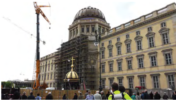
New cross and lantern before installation on the dome of the Humboldt Forum, Berlin, May 29, 2020.

A hundred and sixty-six years later, after this cross had witnessed social and political transformations, imperialist expansions, world wars, and its own destruction, a replica of the same cross was unveiled in the exact same location, symbolically completing the reconstruction of the Berlin palace in its new role as the Humboldt Forum. 60 The mounting of the new cross in 2020 marked the end of a heated three-year public debate on whether the cross should be mounted atop the Humboldt Forum – a discussion that itself was part of a larger, on-going dispute over the rebuilding of the palace and the establishment of the Humboldt Forum within it. 61