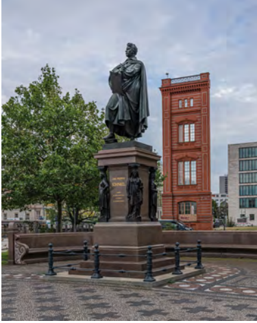
Monument to Karl Friedrich Schinkel at Schinkelplatz in front of the Humboldt Forum, 2023.

A talented and respected architect, city planner, painter, and designer, Schinkel also educated a generation of famous architects and has an architectural style – the Schinkel School (Schinkelschule) – named after him. 42 After a short career as an independent architect, Schinkel joined the civil service in 1810 at the Prussian Building Authority (Königlichen Technischen Oberbaudeputation), of which he became the chief director in 1830. 43 In his roles at the building authority, all under the reign of King of Prussia Friedrich Wilhelm III (1770–1840), Schinkel created many of Prussia’s most famous landmarks, including dozens of palaces, churches, and national monuments, many of which – including the Altes Museum, the Schauspielhaus (then a theatre and currently a concert hall), the Neue Wache in Berlin, and the Schloss Babelsberg in Potsdam – survive to this day. 44