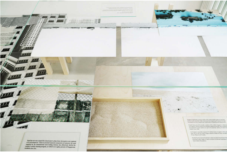
Fig. 2: Monica Ursina Jäger, Liquid Territory, 2018-19, installation view (detail), exported sand, wood, concrete, glass, collages, photographs, and texts, 145x300x140 cm