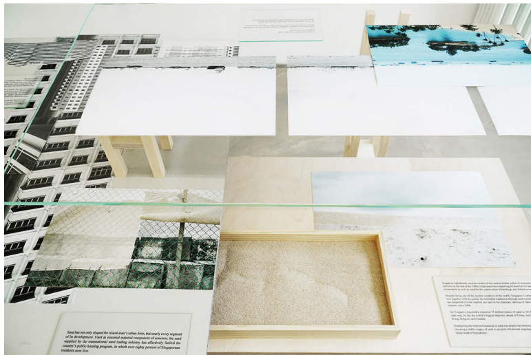
Fig. 2: Monica Ursina Jäger, Liquid Territory, 2018-19, installation view (detail), exported sand, wood, concrete, glass, collages, photographs, and texts, 145x300x140 cm