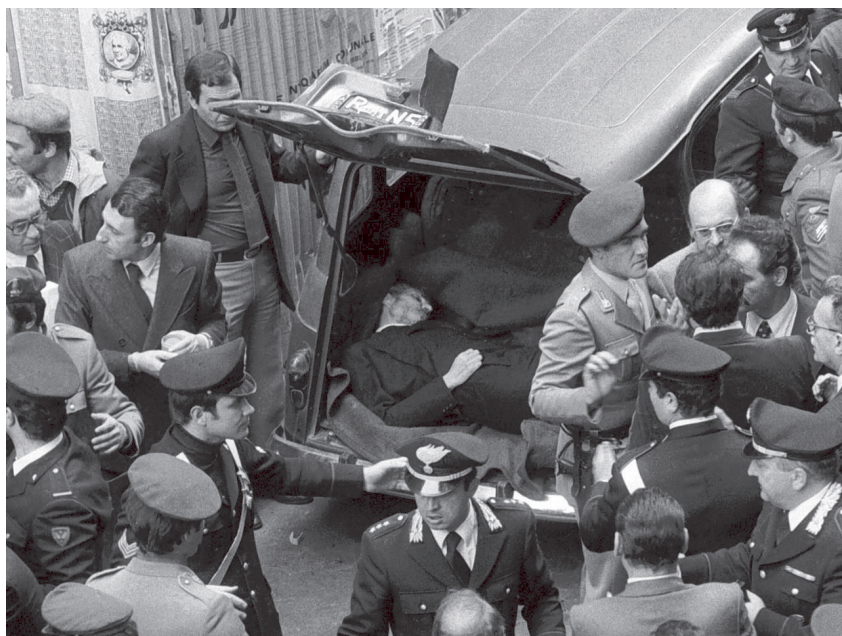
PICTURE 5: The finding of Aldo Moro's body in the trunk of a Renault 4 in via Catani, Rome, May 9, 1978.