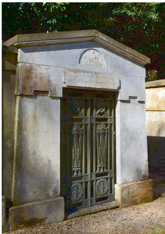
Fig. 11: Family vault of Sir Benjamin Hawes K.C.B., West Cemetery (Image: Daria Pezzoli-Olgiati 2018).

The vault in fig. 11 is a particularly striking example of spatial performativity. Its wording reads: