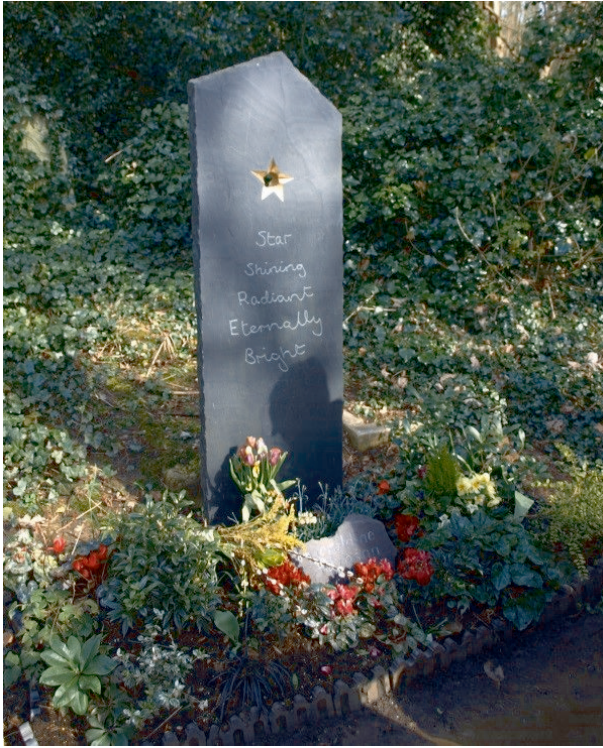
Fig. 3: Grave of Geraldine Adamson, East Cemetery.

light of the celestial body. The gravestone makes no clear reference to a precise cosmic image of the world. Here, the gravestone marks the limit between the darkness of death and the light of a star. By remaining open to interpretation, the grave actively engages the visitor, inspiring varied interpretations of death and afterlife.