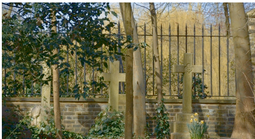
Fig. 9: The fence delimiting the East Cemetery towards the north (Image: Daria Pezzoli-Olgiati 2018).

The planning of the cemetery in the 19 th Century which sought to realise new ideas about burials and sepulchral post-mortem culture, together with today's approach to the cemetery as both a historical site and a burial site, belong to the second layer of spatial meaning making. The social dimension of a place concerns relationships within the communities that inhabit and shape a given area. Walls and fences detach and isolate the cemetery from the outer urban settlement. By means of gates, the transition into and from the cemetery can be controlled. Lanes, stairs, and monumental landscape elements like the Egyptian Avenue or the Terrace Catacombs as well as the many unpretentious small paths determine the routes to different parts of the cemetery, the accessibility of certain memorials, and movement through the whole area.