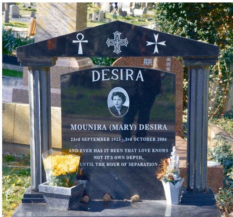
Fig. 7: Grave of Mounira (Mary) Desira, East Cemetery.

The photograph reproduced in fig. 7 is a portrait of Mounira (Mary) Desira, who is buried in the eastern part of Highgate Cemetery. This picture is a materialised memory of the dead woman, with the photograph attributing to her a unique visual identity.