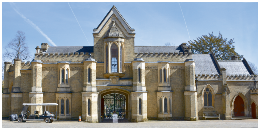
Fig. 8: Entrance to the West Cemetery, captured from the interior courtyard.

in this volume, spatiality can be engaged in different forms, by considering the physical, social and symbolic dimensions of space. 27