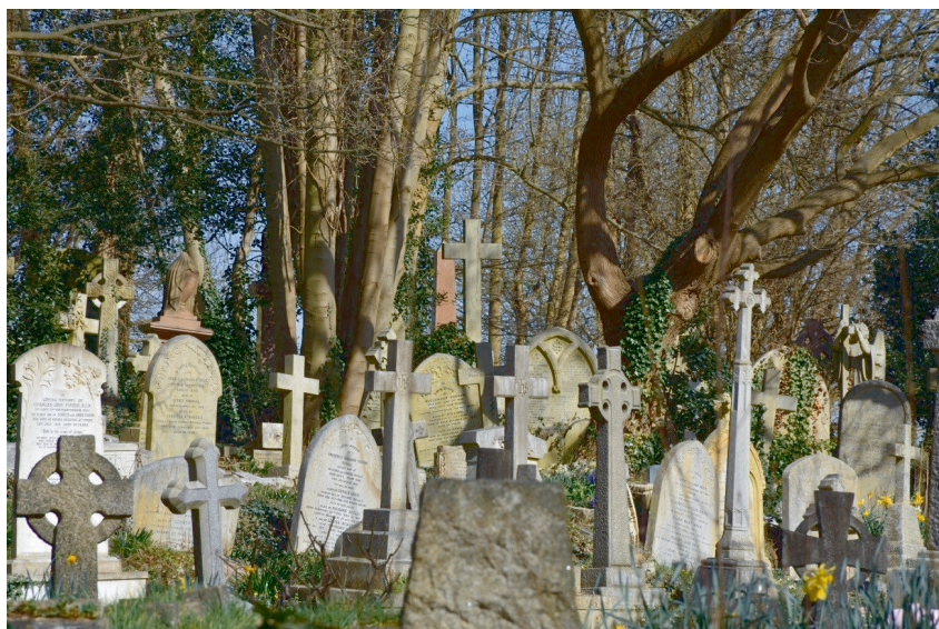
Fig. 1: Graves in the East Cemetery.

idea of mortality as the human destiny) 14 and the bodies encapsulated in its materiality (the dead body, the imagined living person and, of course, the visitor.) The materiality of the tombs marks this relationship, articulating the tension between presence and absence, between visible and invisible, and between the immanent spatial dimension within the cemetery and the transcendent dimension of the realm of mental images, concepts or religious orientation. The performativity of a grave has to do with communication processes by means of materiality that arise whenever somebody looks at the artefact and connects the memorial with mental images,