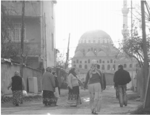
Figure 2: Village life in Göktürk, with the new mosque in the background.

cal venues of a second generation of informal land taking for residential purposes since the mid-1980s. This second wave of development mainly targeted agricultural soils that were either privately owned or collectively owned by villages, but was intermediated by »informal developers« (in colloquial terms: »land mafia«). This class was formed as a result of the first wave of informal land taking in Istanbul between the 1950s and the mid-1980s. It was meant to serve mainly the interests of small scale investors, who had a countryside origin, and entailed splitting the land into small plots. Nevertheless, Göktürk took a different course of development because of an atypical intervention, to be explained below. 8 This alteration was brought about by the Kemer Yapı Construction Co. and the originality of the town fathers' reaction to this movement.