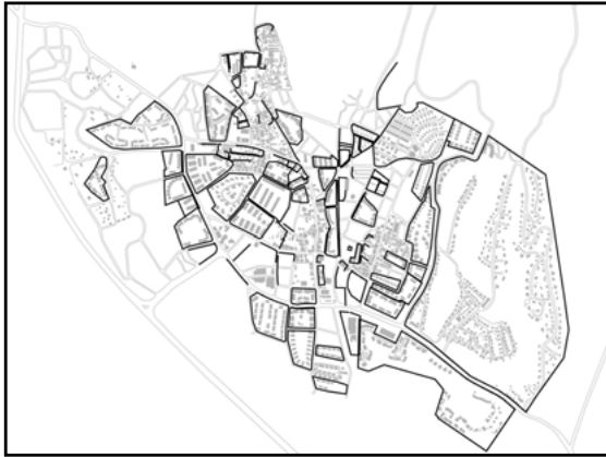
Figure 3: Walls (black lines) surrounding gated communities in Göktürk (2005), Urban Research Studio, ETH Zurich

struction mechanism ready, and the village began its transformation to a town. The 1999 earthquake solidified the new upper-middle classes' belief in the »northern earthquake-safe zones« myth. The construction sector began producing and marketing real estate in so-called geologically-safe lands, which were further away from the fault line south of the city. They targeted these marketing campaigns at an enthusiastic demand profile of the middle, and the process ultimately played a major role in the accelerated development of Göktürk. Today it is a complete boomtown, with content citizens as long as the growth continues. Currently, Göktürk offers people from every status, origin, or qualification – be it the eastern construction worker or the white-collar, high-rank employee from the central finance district Levent – a place to live. Disputes on socio-economic matters and inequalities in this town do not exist for the time being, but will most likely – although not desired – come in the future. This collective suppression of potential conflicts keeps the town politics in order, in strictly neoliberal terms.