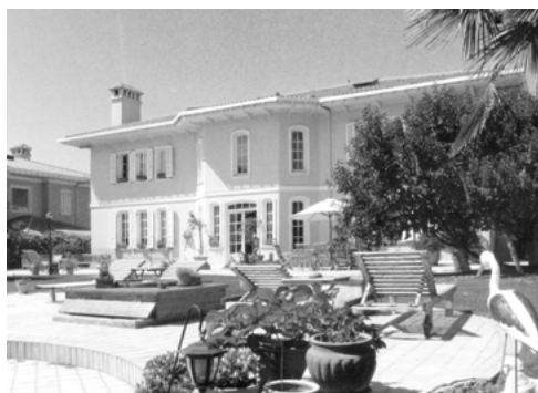
Figure 5: Villa of a gated community in Göktürk (Göktürk Municipality: Dream to Reality 2006: 74)