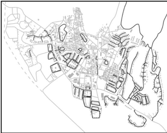
Figure 4: Public roads (grey) and private roads (black) in Göktürk (2005). Urban Research Studio, ETH Zurich

On the other hand, there is the heterogeneous urban fabric of the village, an accumulation of hundreds of uncoordinated small-scale building activities, designed according to individual needs and possibilities. Their inhabitants stem from rural areas, maintaining traditional and familiar social networks celebrated in public space. For most of them, living in Göktürk is an ongoing financial investment, and gives them social and practical resources for the improvement and consolidation of their traditional village life.