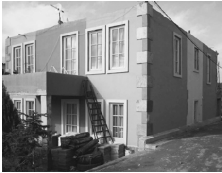
Figure 6: Decorated village house in Göktürk.

developments, targeting new costumers at the lower income levels. As a result, most of the newly built gated communities in Göktürk are far less luxurious and spacious than their predecessors. Recent developments are even exceeding the urban density of the village. Thus, the real estate market has triggered a paradox dynamic of mutual assimilation: villagers are slowly catching up with their new neighbors while the average standards of gated communities are decreasing. The once distinct differences between the luxurious estates on one side and the underdeveloped village on the other side are becoming obscured.