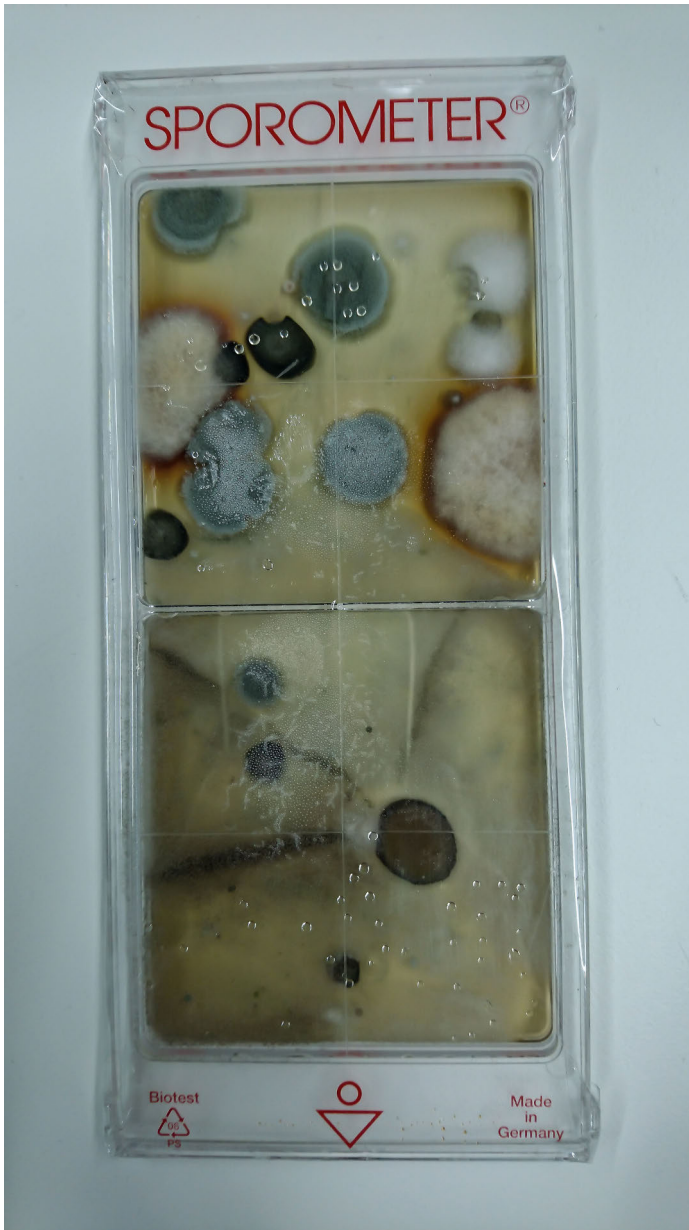
Figure 6.1: The incubated Sporometer.