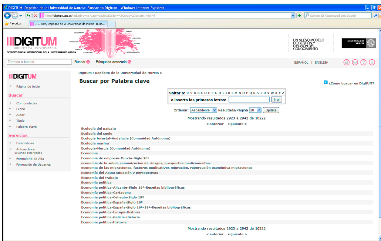
Figure 1. Display of Subjects in Digitum