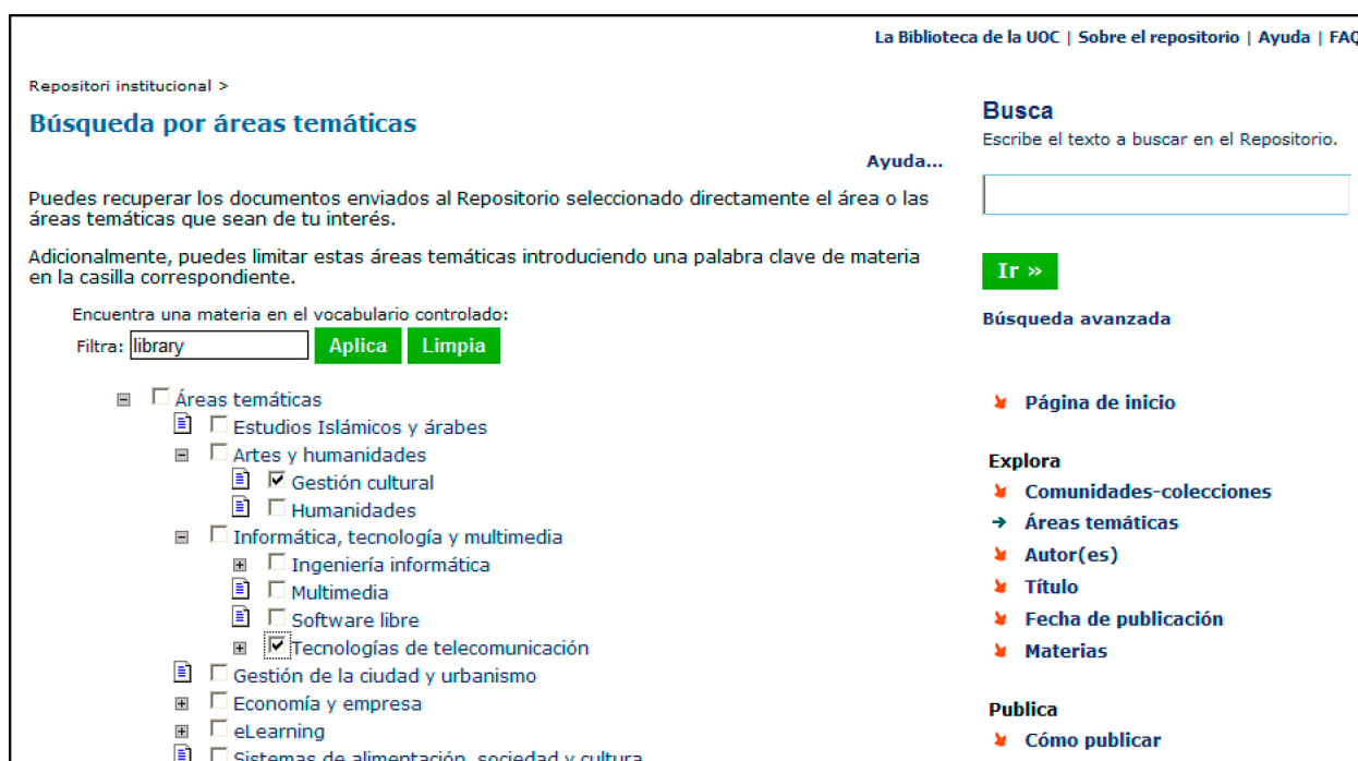
Figure 3. Thematic Areas in O2 of the Open University of Catalonia

The handling of authorities in the group of university repositories studied may be described as uneven. Greater interest may be observed in controlling au-