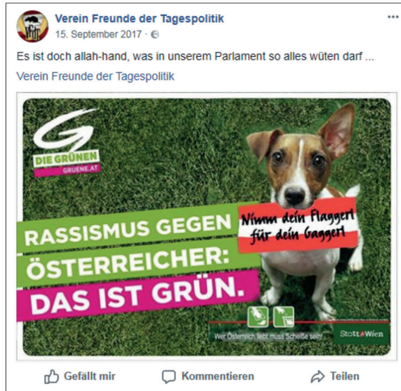
Figure 1. Satirical election poster ascribed to the Green Party and shared by the Austrian page Verein Freunde der Tagespolitik on September 15, 2017. The poster text translates to "Racism against Austrians: This is Green." The description text written by Verein Freunde der Tagespolitik uses a pun with the word "Allah" and translates to "That's the last straw, what is allowed to rampage in our parliament."

crimination against minorities. Within the pages' and groups' satirical and serious posts, we identified the use of populist strategies including the ostracization of others , attacks against the elites , and advocacy for the people (Engesser et al., 2016). Pages and groups turned against the political establishment in satirical form. In the case of one post published by the Austrian page (see Figure 1), a campaign slogan of the Austrian Green Party (This is green) is mimicked to equal Green politics to racism against Austrian natives. This satirical poster seizes the narrative of the elites who would neglect their people ( us ) and only serve the interests of foreigners ( them ). The meme is combined with a posted message in which a pun referring to "Allah" establishes a link between the unnamed them and Muslim immigration. Also posts, which derogated minorities and some of society's most marginalized groups (e.g., homosexuals, transgender, migrants; see Figure 2), were typical contents across all pages and the group in the material.