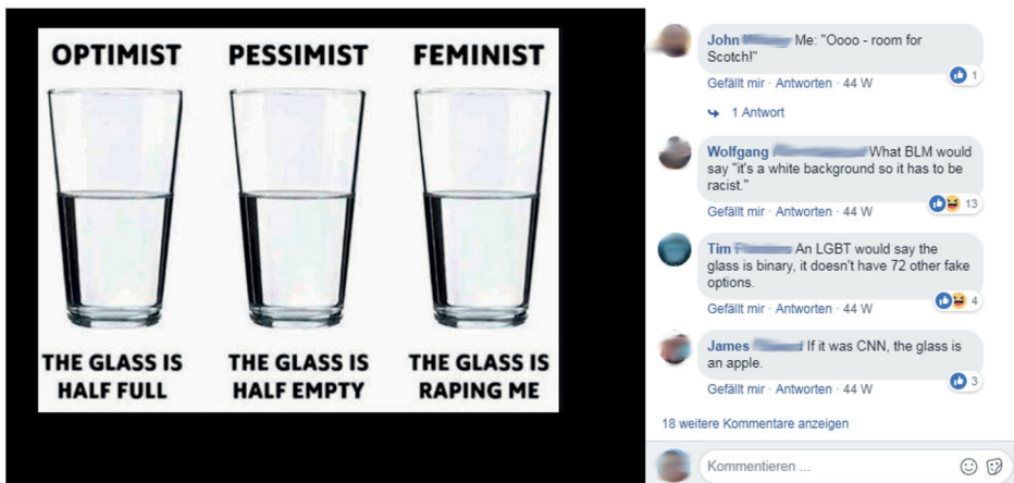
Figure 5. Meme and respective commentary posted on the page Laughing at Stupid Things Liberals Say illustrating how users follow and further the logic of the joke made in the post.