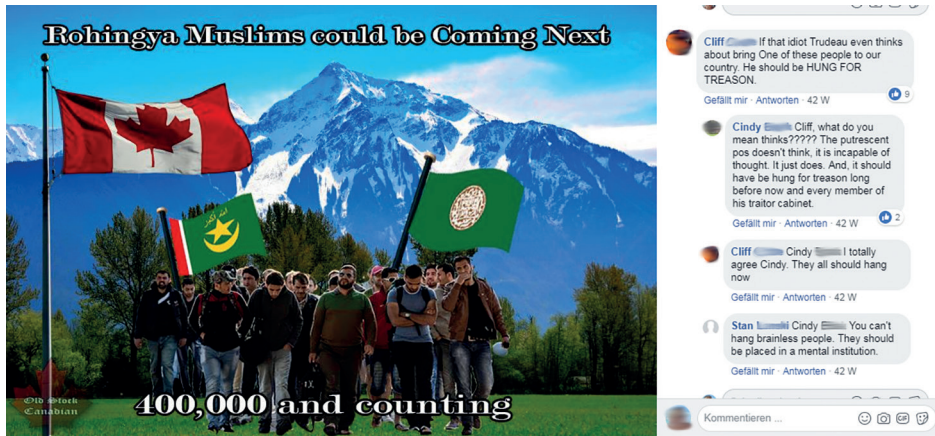
Figure 7. Meme and commentary are illustrating a spiral of escalation on the page OldStockCanadian .

and Matamoros-Fernandez (2016), which suggested that discrimination on Facebook pages of extreme right political parties is merely implied and “then taken up by their followers who use overt hate speech in the comment space” (p. 1167). It is thus again the analytical look on the discursive ensemble of the posts and comments in combination that helps understand the intentions, the dominant reading in the group and the implications of satirical content beyond the actual post.