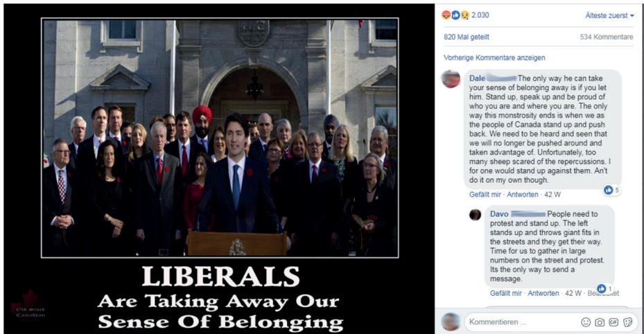
Figure 3. Meme and corresponding comments posted on the Canadian page OldStockCanadian .

Furthermore, a clear narrative of self-victimization was purported in the form that extreme right supporters are staged as oppressed minorities and victims of the new “liberal” ideas and values, which would ultimately rob them of their (national) identities (Figure 3). In sum, it becomes evident from the analysis of the original posts that creators and administrators of satirical Facebook pages and groups use them for promoting extreme right narratives, stencils, and images (see Wagner & Schwarzenegger, 2018, for a more detailed description of the analysis). As described above, after the initial analysis of contents shared by the pages/group we then analyzed the combination of post and comments and how these were related and played together, supported or questioned another and how this may contribute to the discursive strategy of mainstreaming.