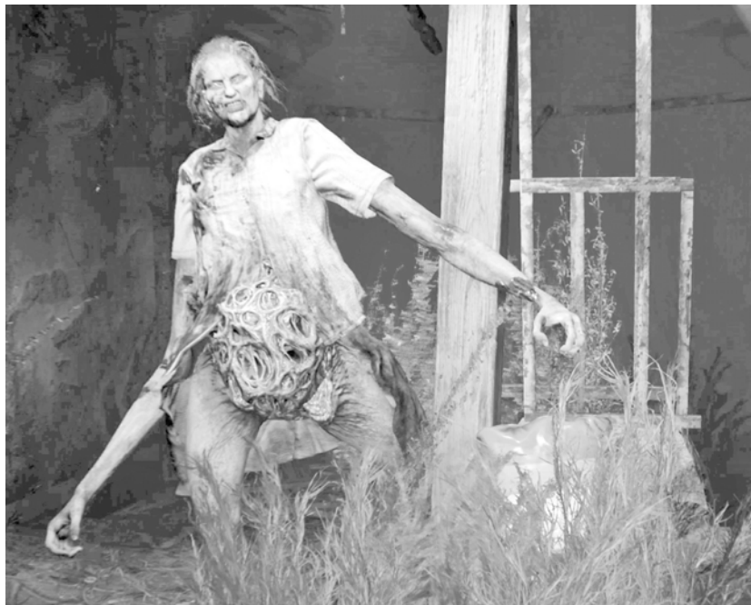
Fig. 3: Marguerite's mutated form and insectile vulva