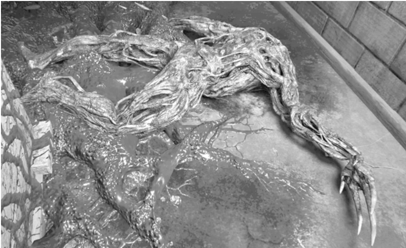
Fig. 1: The structure of the Molded body (headless)

Molds are a type of fungus that grow in elaborate networks of microscopic filaments called hyphae. These hyphae weave together to create thin, fuzzy patches or thick, branching root-like structures. Hyphae secrete digestive enzymes to break down the substrates they grow on, absorbing nutrients to enable further growth. Some molds are parasitic, growing and feeding on living organisms without killing them, but most are saprophytes: decomposers that do not attack living things. While in the minority of known mold species, toxin-producing molds are common in many environments and can consume almost any nutrient-rich substrate (Coppock and Jacobson 2009, 637). A wide variety of fungi are capable of producing mycotoxins and many produce several different toxins that can have varying effects. The Bakers' buildings, water damaged and showing initial infestation in the basement, take on the standard environment of infection. As molds decompose dead matter, they metabolically generate heat and release moisture from the material breaking down. This moisture and heat are ideal for further mold growth, creating