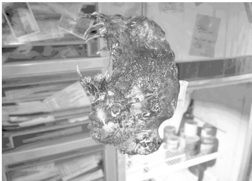
Fig. 2: The Deputy's head

In Mia's flashback, we see that Molded are also produced by Eveline, specifically from a substance that she vomits. The association with illness and contagion is obvious: vomiting is a common sign of both infections and toxins. We see the transmission in a cut-scene when Alan, Mia's partner, repeatedly vomits a black substance as his wrist heart-rate monitor shows he is dying. This grotesque death has Mia crouching down and focusing on Alan; from this angle we see nothing